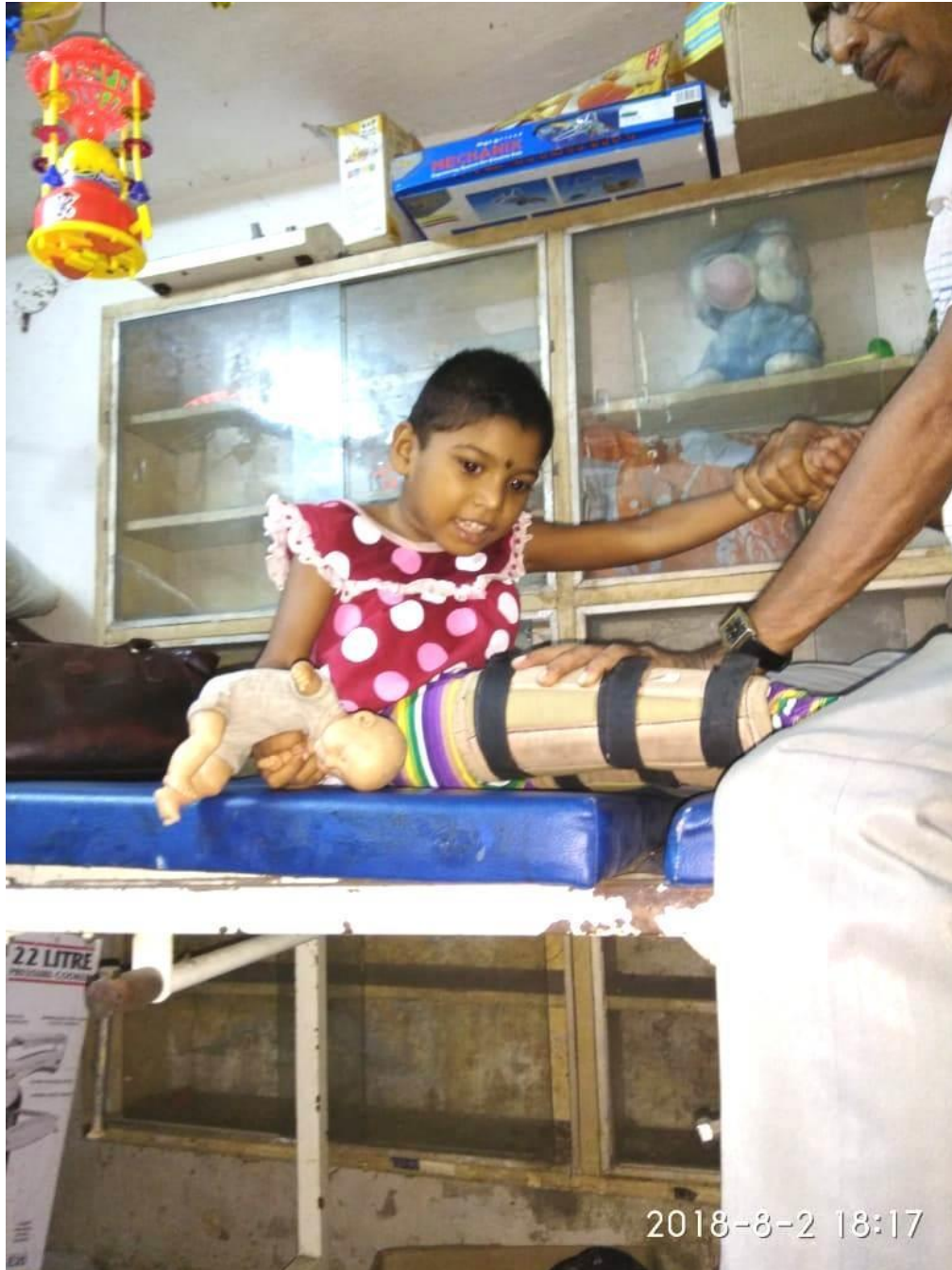
PHYSIOTHERAPY FOR CEREBRAL PALSY CHILDREN

Email: voiceofworld@gmail.com Website: www.voiceofworld.net