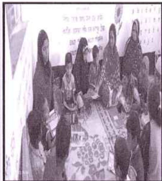
Learning about vegetables from the teacher in the language class and enjoying the Drawing class