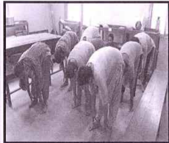
Ongoing Drawing class ,Cookery class, Mud plate painting and Yoga Class