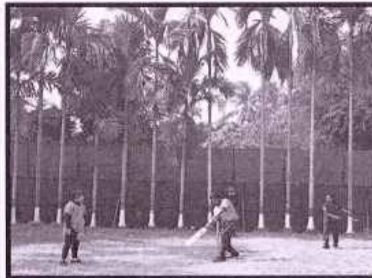
Students of ALO and SCDC are enjoying Picnic