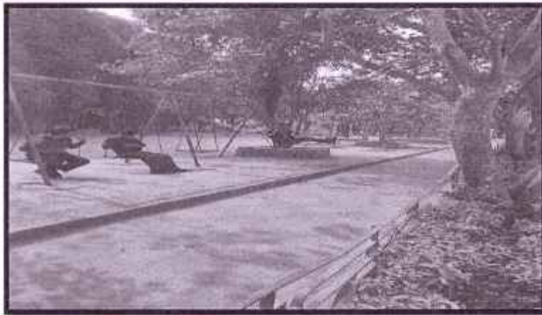
Adults of ANANDANEER enjoying Picnic