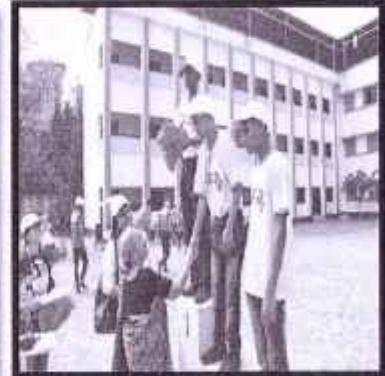
4.working in Block Vocational Zone 5. Aerobics and exercise session 6.watering plants 7.The teacher helps in Stitching and Sewing 8.Local area shopping 9.Durga Puja celebration 10. Christmas celebration 11,12. Picnic 13. Marching on the Sports Day 14,15. Won prizes