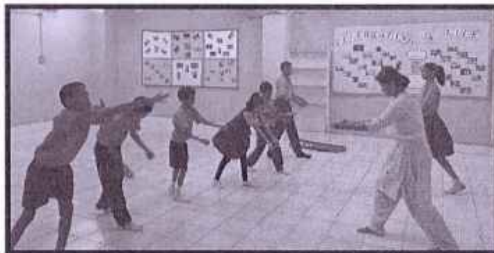
Dance Class conducted for Students of H.I unit- practising for an upcoming programme