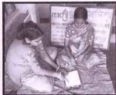
1.Children following the RRW and Exercising 2.Children are enjoying Drawing class 3.Number work class 4.Communication class 5. Children love Story Telling time 6.Enjoying Table activities 7. Game Time is Fun for them 8.Tiffin Break 9. Making a mother understand her child's Holiday home work before Vacation