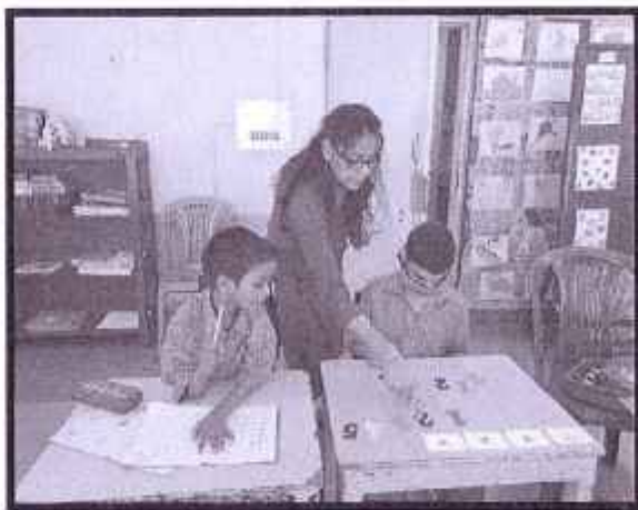
Ongoing Remedial classes – of different groups under Intellectual Disability unit, Hearing Impaired unit and Cerebral Palsy unit