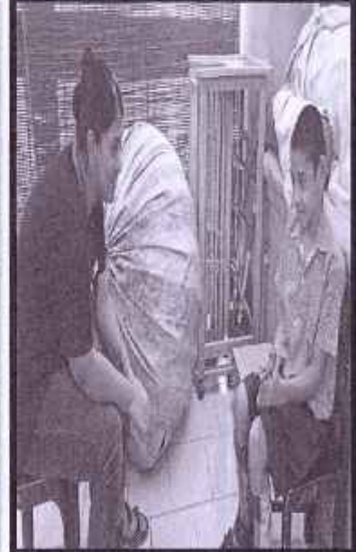
1. Balance Board training for improving balance 2. Muscle(TA) stretching 3. Bridging exercise 4. Stair climbing 5. Lumber and back strengthening by Gym ball 6. Hand Grip Strengthening