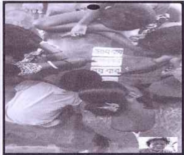
1.Prayer 2. Vocabulary class 3. Language class 4. Number work class 5,6 .Game time 7,8 .Class observation by the Coordinator