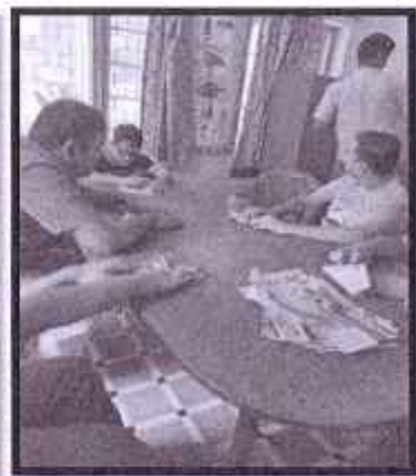
1. Engrossed in Puzzle Solving 2. Ongoing Art & Craft class 3. Making paper packets (Thonga)