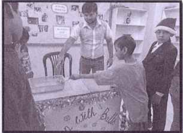
Physiotherapy session, Music & Movement Class, Boys enjoying Children's Day party, Christmas party at REACH premises