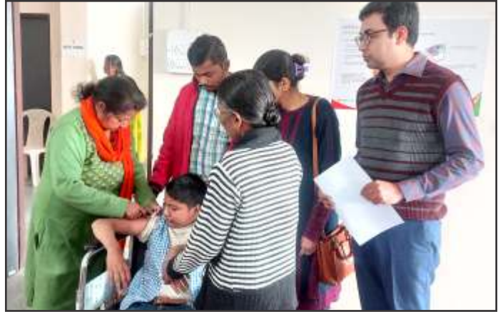
Rubella Vaccination of Students