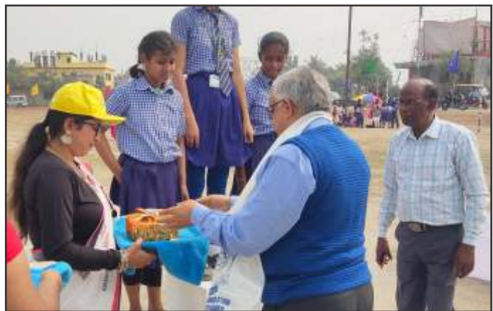
Glimpses of Annual Sports 2023