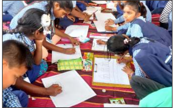
Sit & Draw Competition of Students