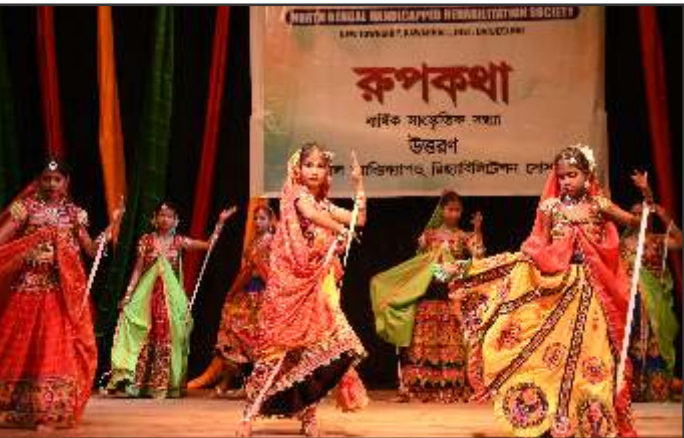
35th Foundation Day Celebration at Dinabandhu Mancha