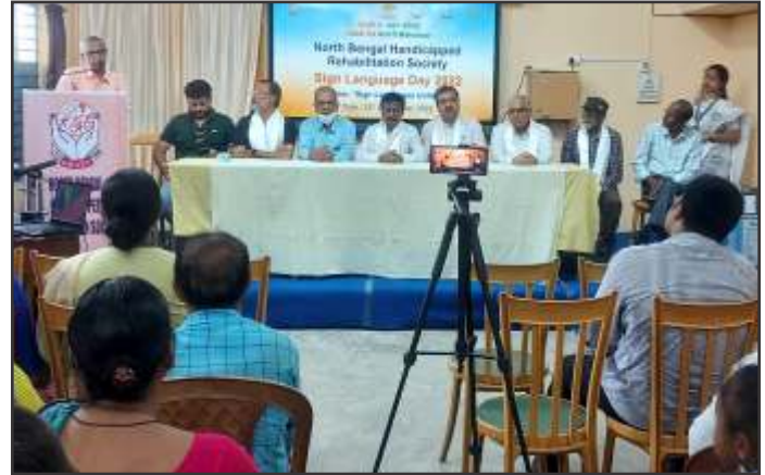
Observation of Sign Language Day 2022