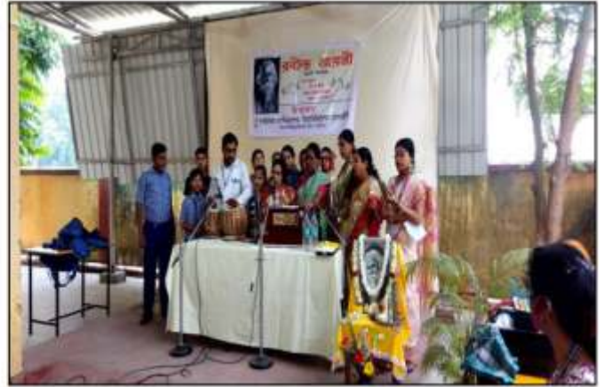
Rabindra Jayanti Celebration by Students & Teachers at Uttaran School