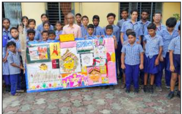
Wall Magazine made by Students