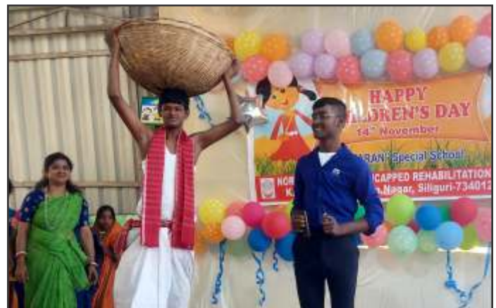
Celebration of Childrens' Day 2022