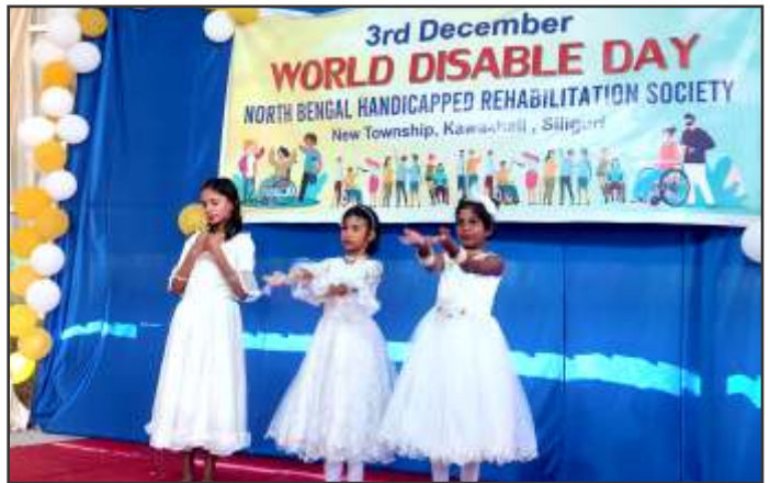
World Disable Day 2022