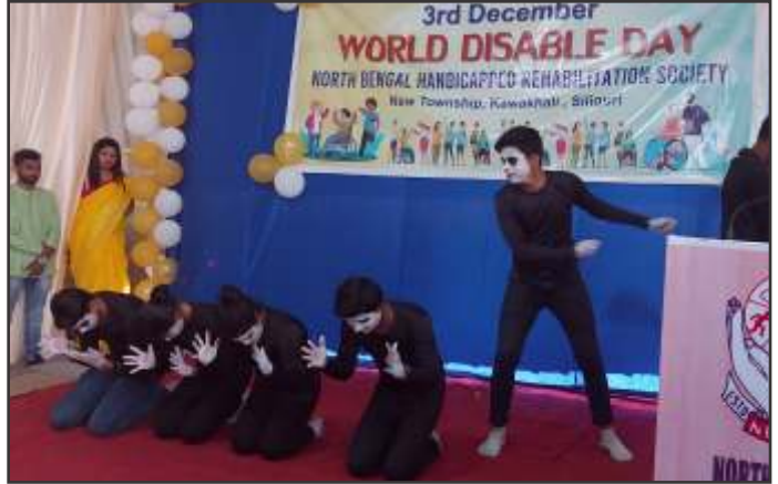
Students performing in World Disable Day