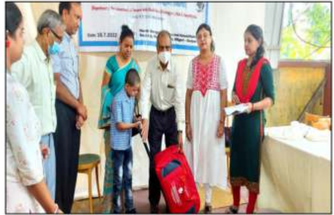
TLM Kits for ID students Distribution programme by NIEPID at Uttaran