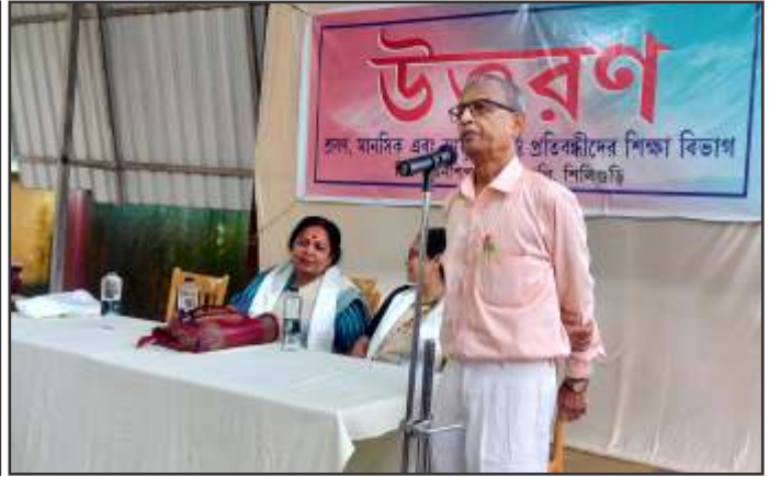
"Rakhi Bandhan" Celebration