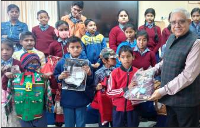
Winter Garment Distributions to students