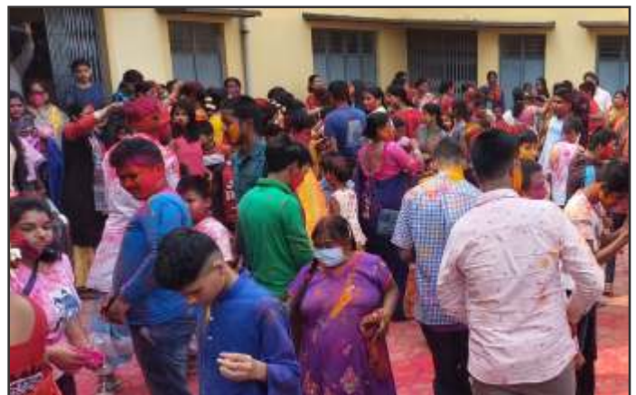
Glimpses of Holi Celebration 2023