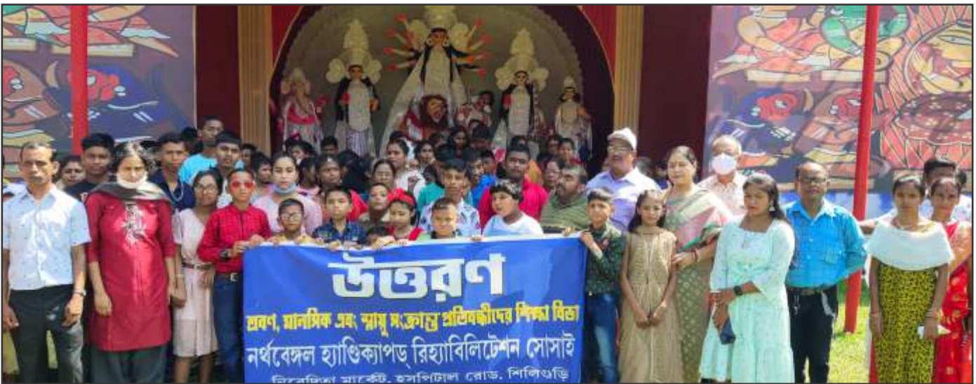
Puja Parikrama of Uttaran Students on Durga Puja Festival 2022