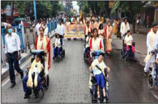
Students & Teachers participated in Barga Baran Programme organised by Siliguri Municipal Corporation