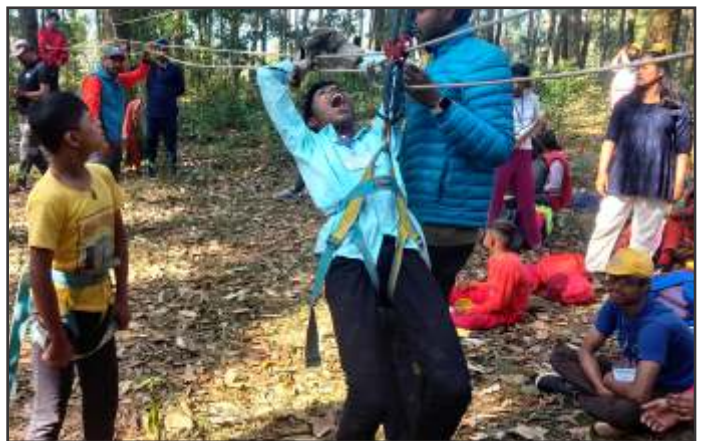
Students participating in Nature Study Camp 2022