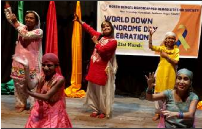
World Down Syndrome Day Celebration