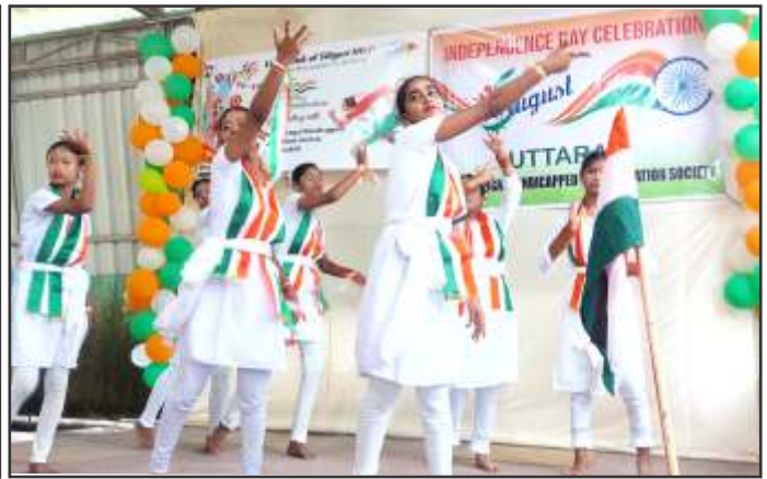
"75th Independence Day" Celebration