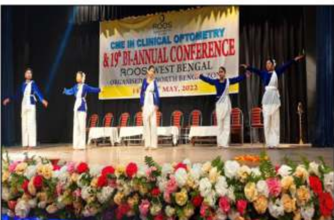
Students participated in CME in Clinical Optometry programme at NBMCH