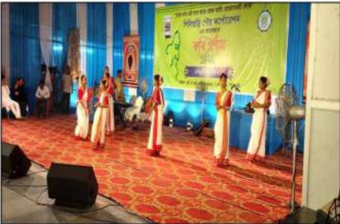
Students of Uttaran participated in the Rabindra Jayanti Celebration organised by Siliguri Municipal Corporation