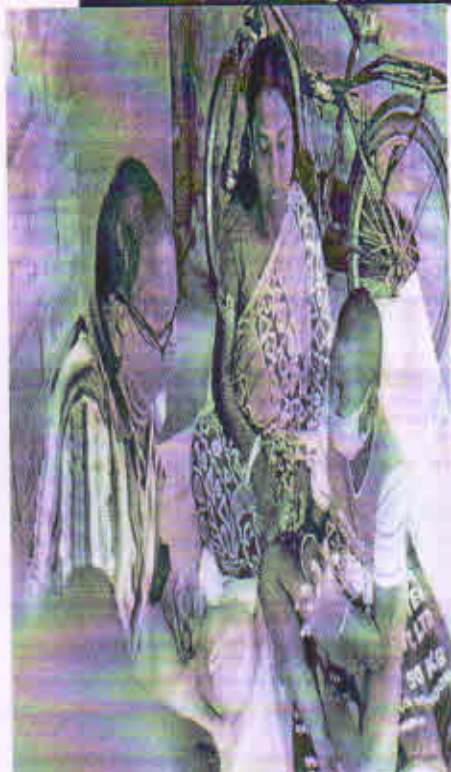
Activites done in July 2020