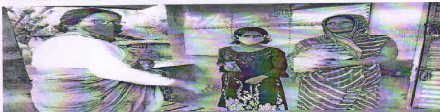
Activites done in July 2020

The organisation is running Disha cum Vikkas day care centre at border area of Nadia District . The centre is located at Charatalapara Mahisbathan , Nadia. 35 inmates has been enrolled in the day care centre . Different types of therapy including counseling has been provided to the inmates . The staff's of the organisation provided rotation during the lockdown period in the door step to the beneficiaries . Medical support also has been also provided to the beneficiaries during the lock down in their door step . The organisation was arranged online classes for the beneficiaries . We also therapy to the inmates house . We also provided smart phone's to inmates guardian for taking information & online classes . Follow up was done in regular intervals . Some photos of activities has been given below. Funding has been provided from National Trust , New Delhi, regularly .