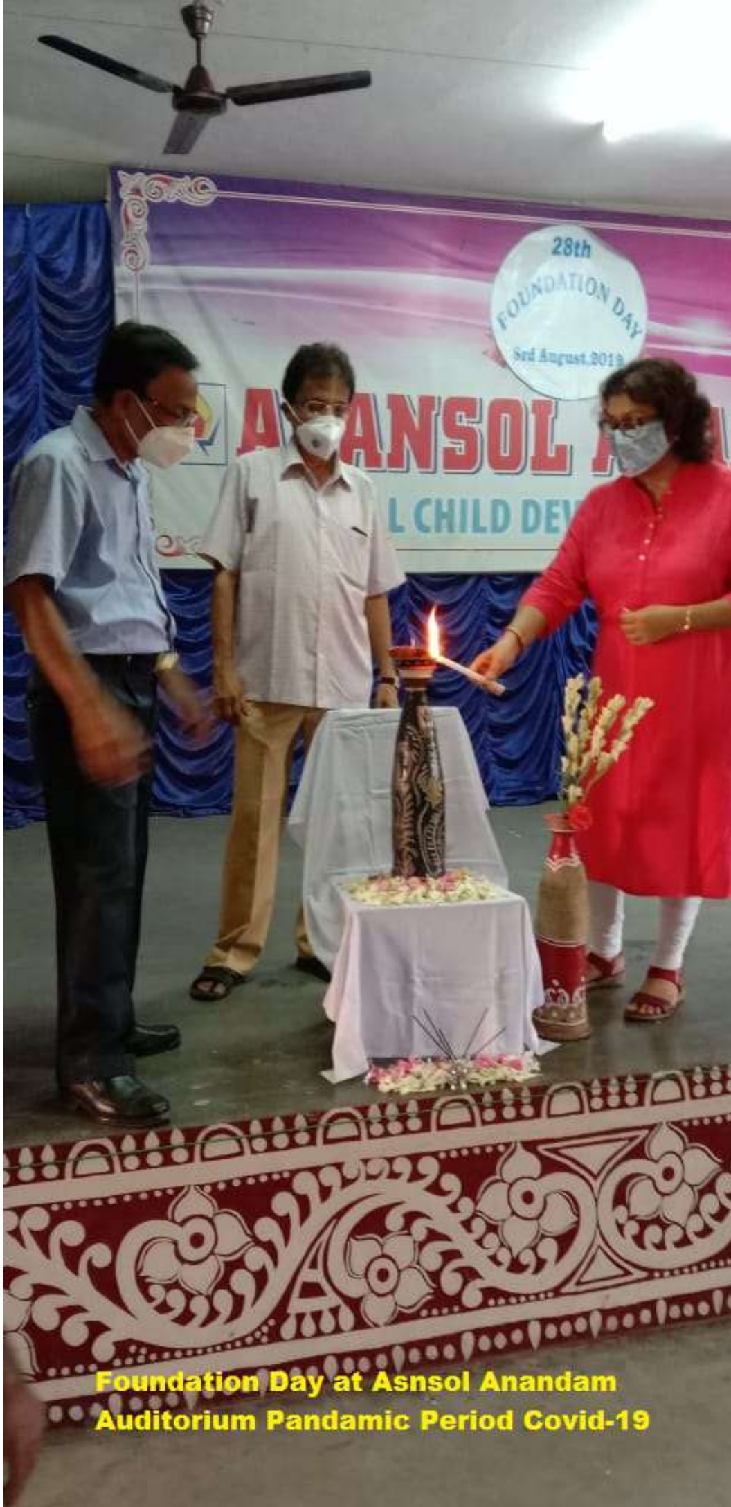
Foundation Day at Asnsol Anandam Auditorium Pandamic Period Covid-19