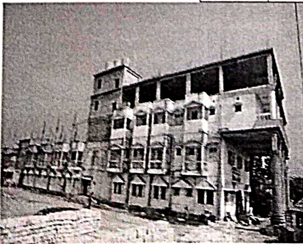
Building of Arogya Sandhan Residential Home

Attested Arogya Sandhan Charitable Trust