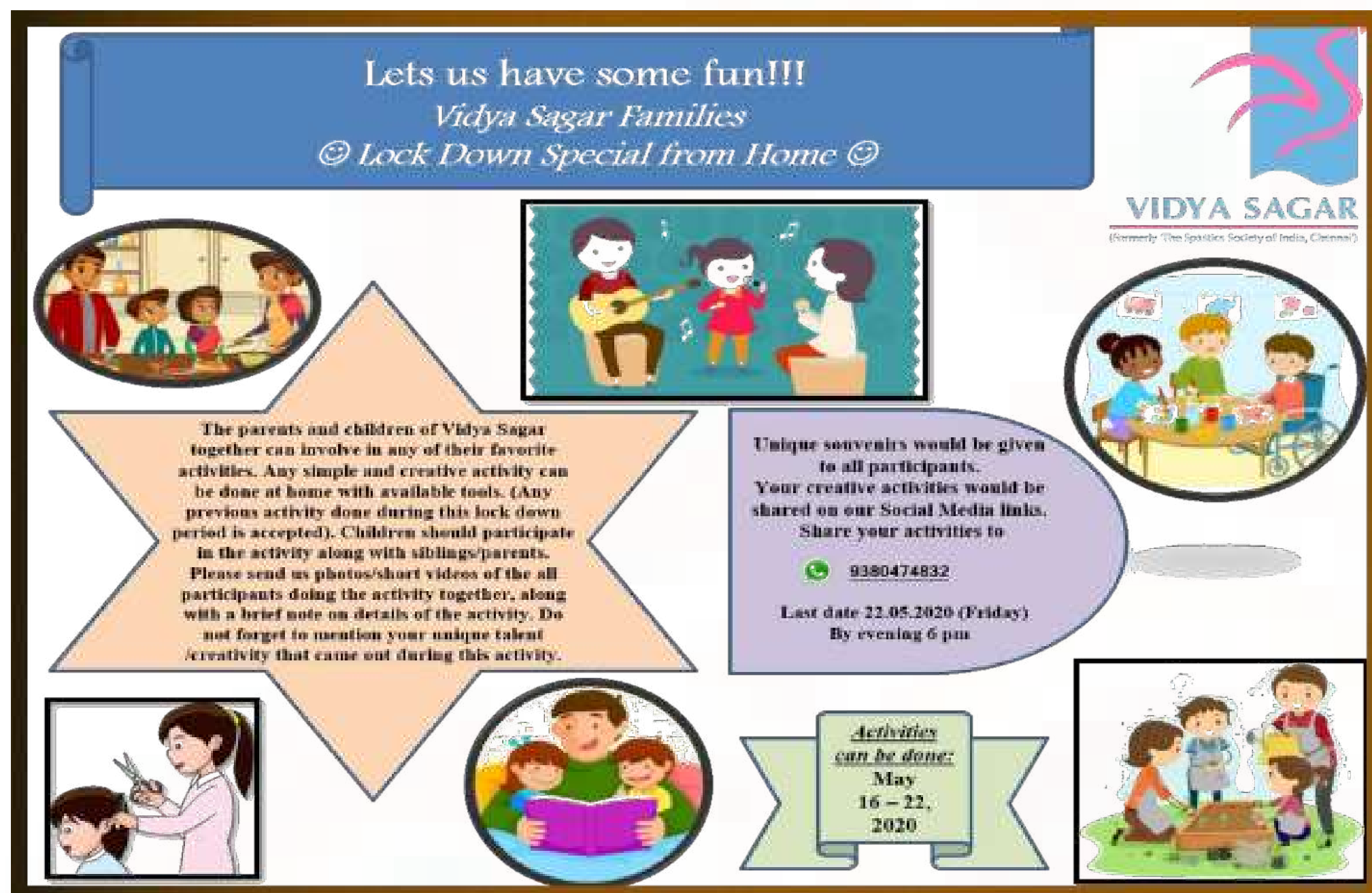
Picture shows poster made by Vidya Sagar inviting families to share photos or videos of creative activities being done at home during lockdown

We even conducted an online fun event during May 2020 called "Lockdown Knockdown" to keep everyone's spirits high amidst the uncertainties around.