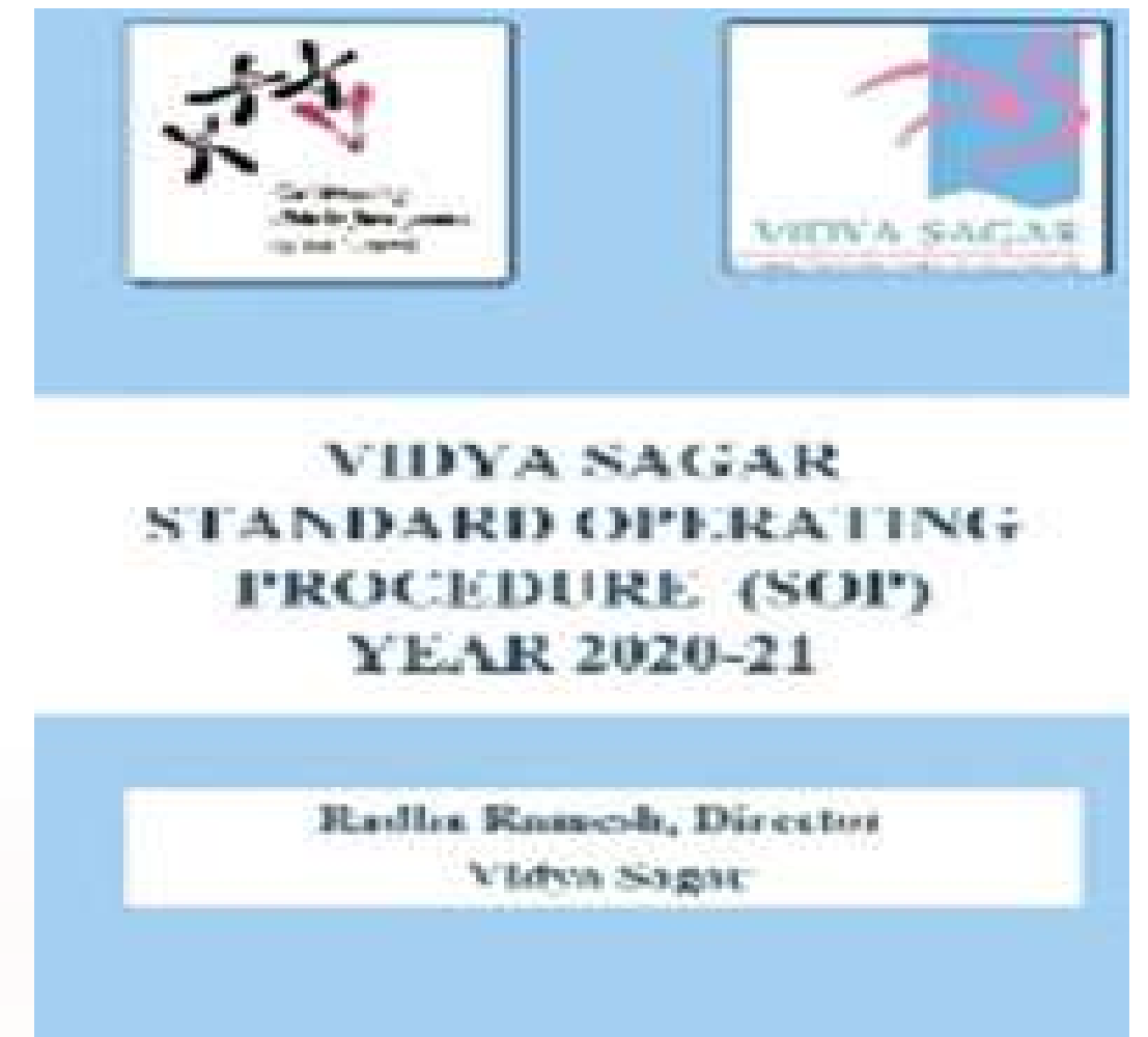
Click on the picture to read full SOP

We also shared a copy of our SOP with the Commissioner, Disability Welfare for review.