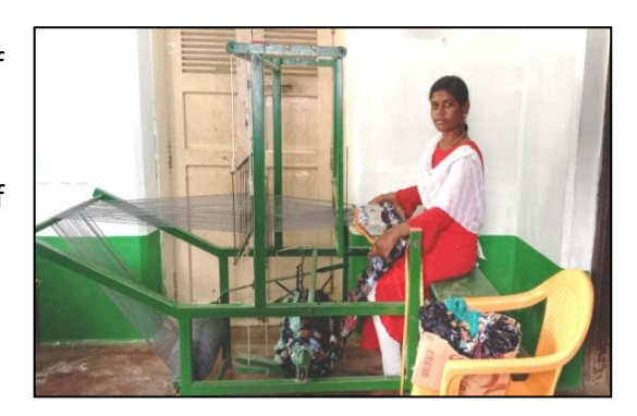
Doormat Unit at Musiri Centre

Sale in Delightful Shoppy, Coffee Shop & Handwork Articles fetched us an amount of Rs. 42,013/-