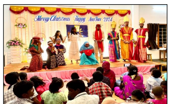
Manger Scene in Christmas Programme