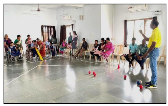
Paralympic Sport, Boccia Game being played by CP children in the Auditorium

In order to commemorate Gandhi Jayanthi Day, Fancy Dress Competition was organized at Trichy Centre. This programme was held on 2 October 2023, sponsored by Lions Club of Trichy (Host).