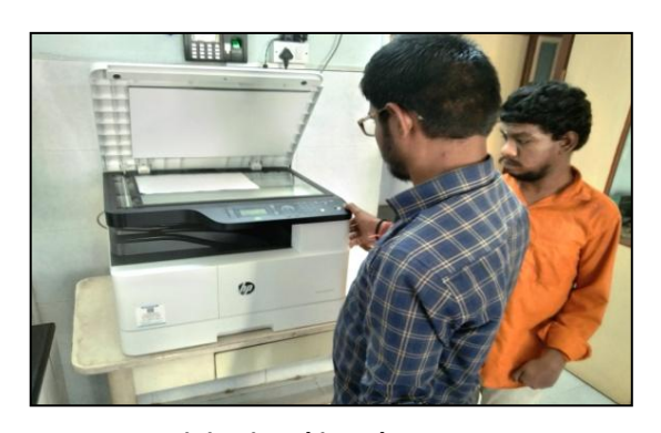
Training in taking photocopy