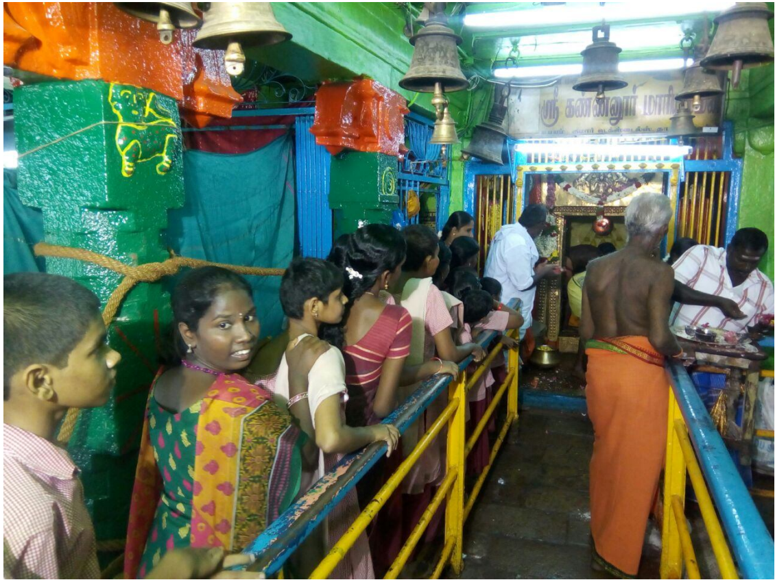
Celebration of Independence Day by the beneficiaries of Samarth cum Gharaunda centre on 15.08.2017