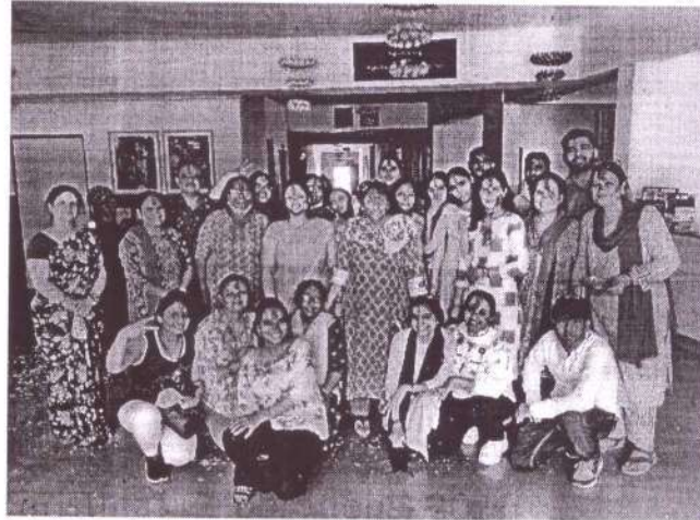
Holi Celebrations – 2022