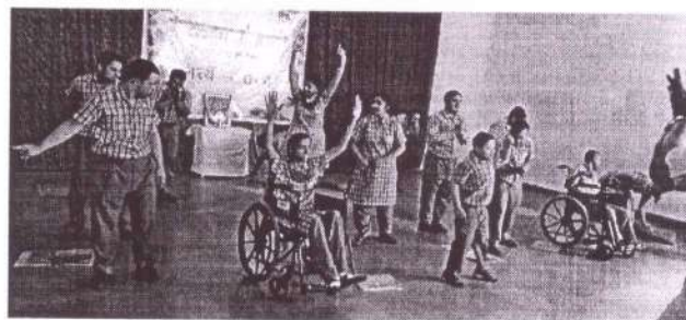
International Dance Day- 2022