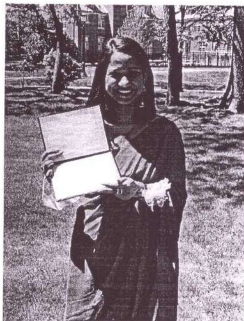
Congratulations ma'am at completing the ELP course at Perkins School for Blind, Boston, MA, USA.