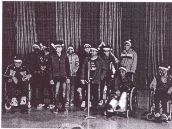
Christmas Celebrations- 2021