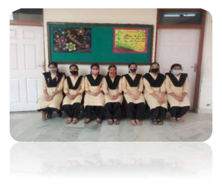
Class - XII