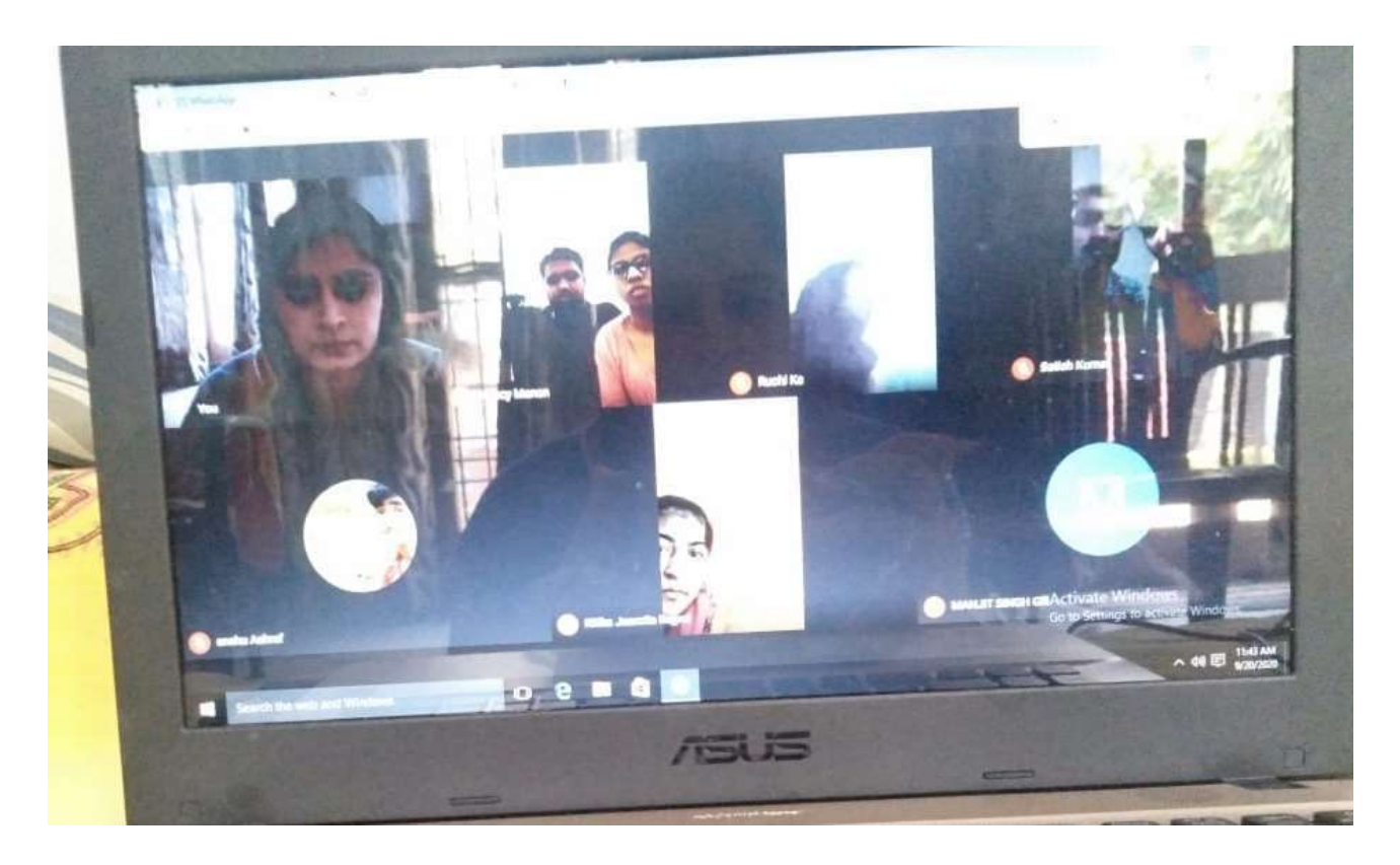
May 3, 2020: Initiated online teaching and Therapy for Intellectually Disabled