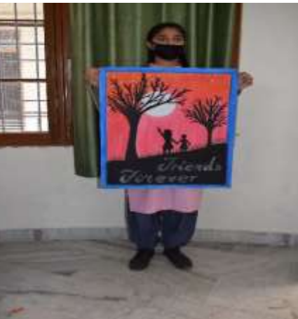
Nov.13:- Rangoli competition held in school under Childline Week.