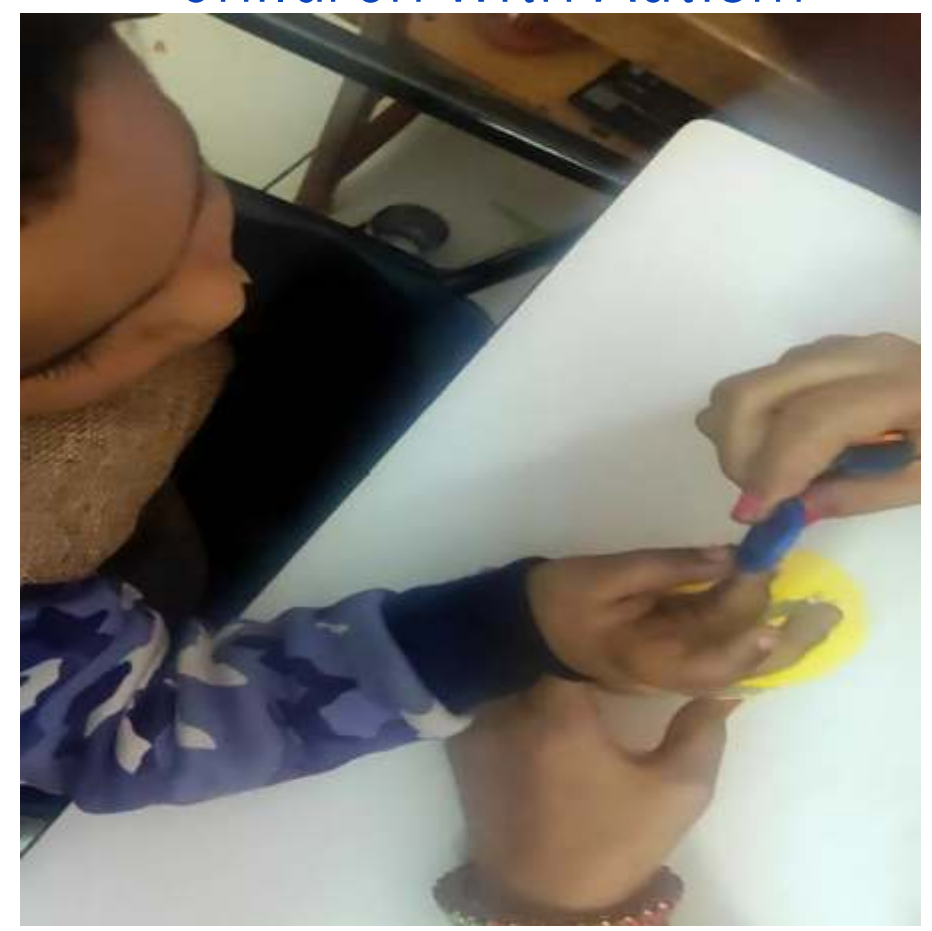
Specialist providing ABA therapy