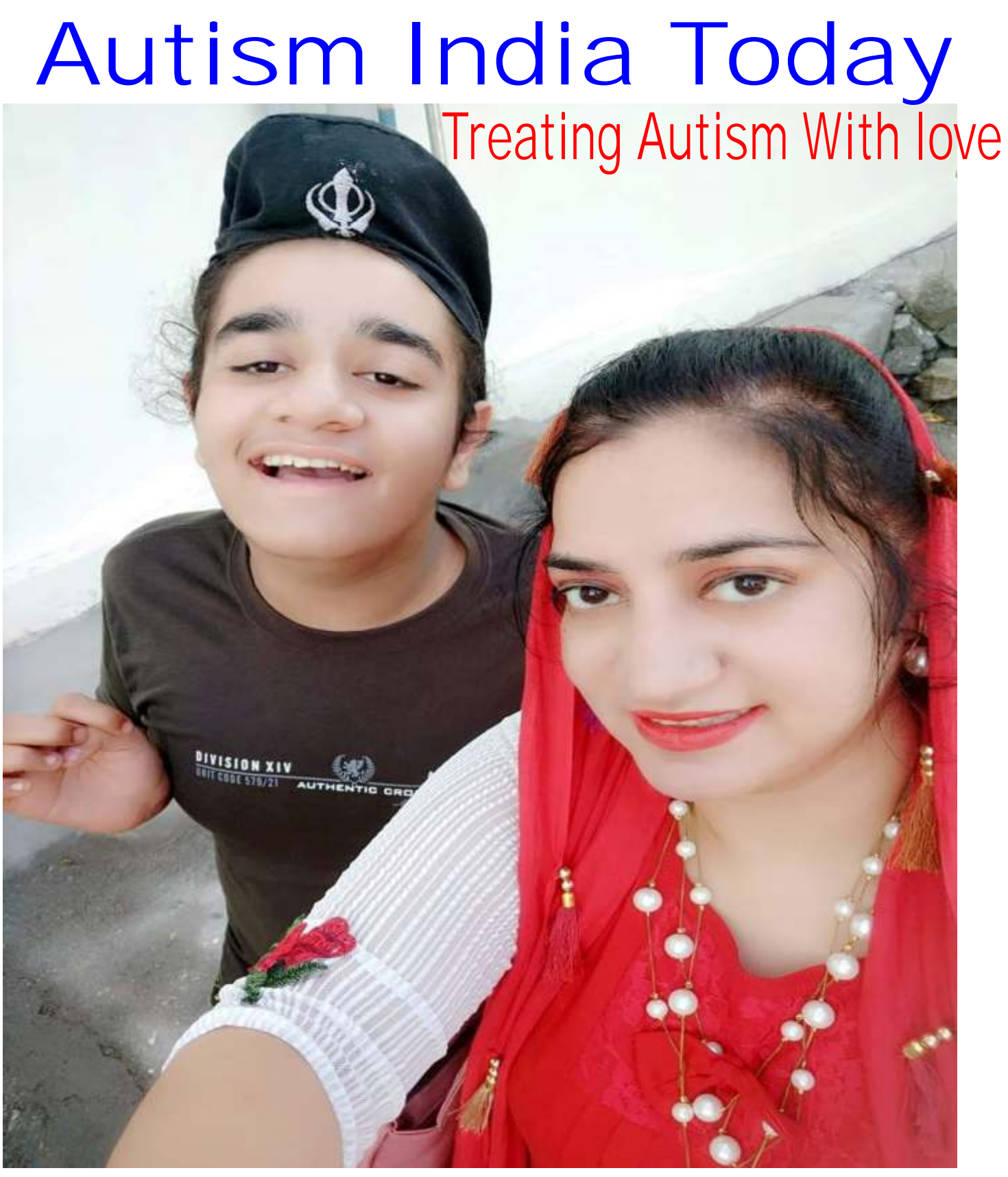
# 5 Hargobind Nagar Sarhind road Patiala 147004