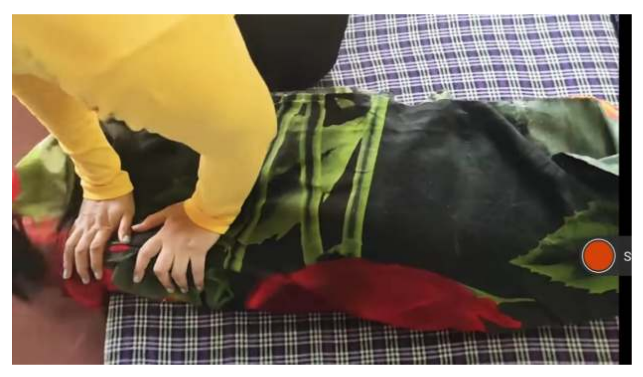
Therapists at Autism India Today providing Sensory Diet need As deep Pressure