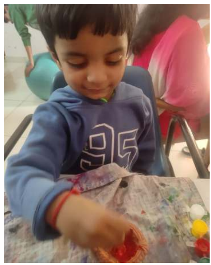
Working With children to make their life better