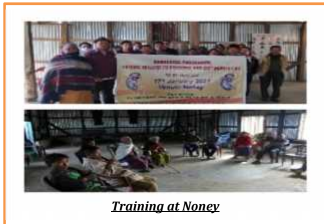
Training at Noney

Handicapped Development (HD) Foundation, Manipur and Handicapped People Association, Tamenglong has been organized one day awareness programe related to healthcare due to COVID -19 on 16 th January 2021 at Noney. Awareness program was given how to prevent the COVID-19. The information gave the information about CoVID-19 to the parents and guardian of the persons with disabilities. Families and parents and caregivers who take care of children with special health care are very important during the COVID -19 and gave information how to practice home therapy and caring the children during lockdown.