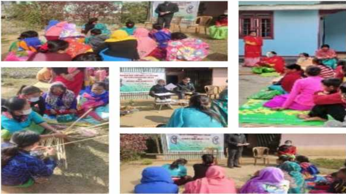
Training at Khangabok

We strongly believe that this awareness and training will give great impact to the society to change a better society.