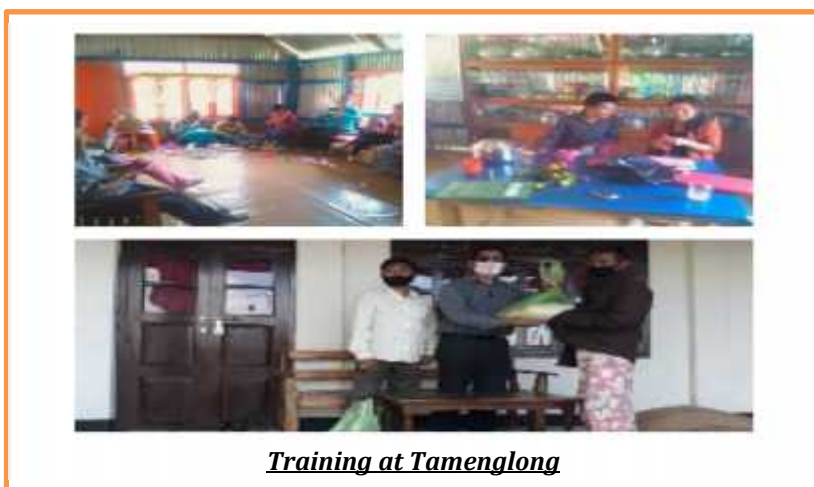
Training at Tamenglong

It promotes economic developmental activities for the benefit of income generation. The training programme was done for 15 days. Under this training programme the expertise was taught how to make kouna bag making and Hand Embroidery. During the training, expertise was also taught about marketing, costing, budgeting, pricing and promoting their product. We will work for the persons with disabilities till achieving our goal in mainstreaming them.