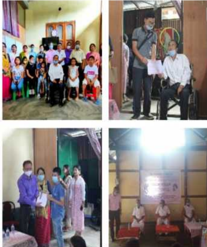
140 th Birth Anniversary of Helen Keller

The Handicapped Development (HD) Foundation, Manipur, SAVI Manipur and SAKSHAM Manipur Prant were celebrated 140 th birth anniversary of Helen Keller at Wangoi, Imphal West on Saturday, 27 th June 2020. The program was started 11.30 am. The celebration was attended by around 50 participants which include Persons with Disabilities, members from (SAVI Manipur, SAKSHAM Manipur Prant and Handicapped Development Foundation Manipur Staff) and local Panchayat Members etc. The celebration starts with floral tributes to photo of Helen Keller. The presidium member's speech one by one. The program was closed 3.30pm. Online video competition also organized in connection with 140 th birth anniversary of Helen Keller. Around 8 persons was participated the online speech competition.