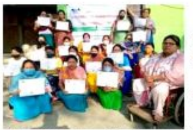
Relief Centre for the Welfare of Differently