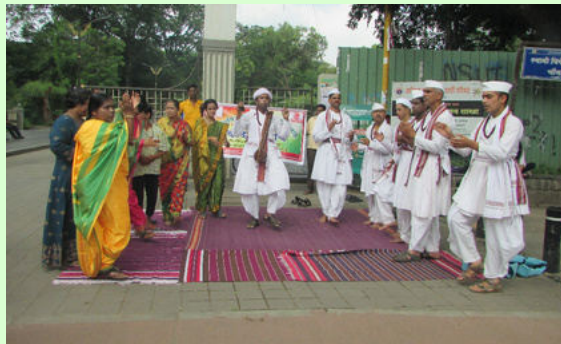
Street Play on Organ Donation: Friends performing near Fergusson College gate