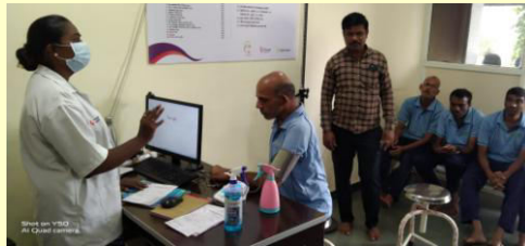
Left: Free health check-up at Asian Paints Community Hospital, Nayagaon;