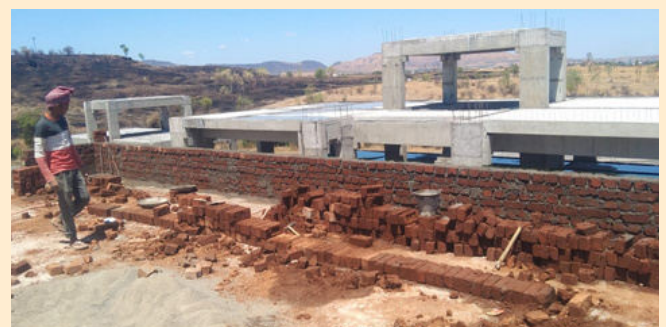
Current status of construction of Asawali unit