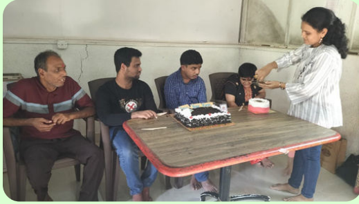
Celebrated birthdays of September-born special friends at Marunji