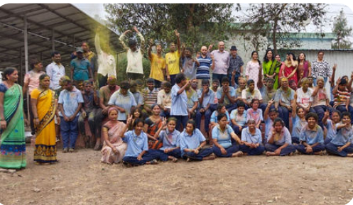
A team of Melodious breeze organized a musical program on the occasion of Rangpanchami