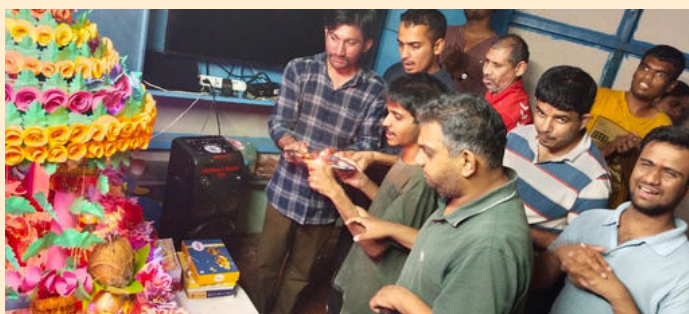
Ganapati Aarti by Special Friends