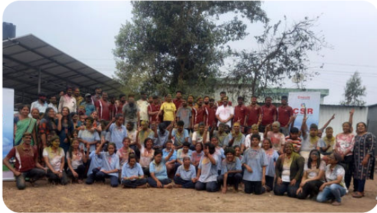
Emcure team celebrated Holi with Special Friends at Navkshitij Marunji campus