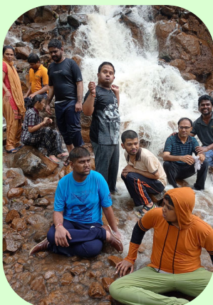
Day Care students went on a one-day trip to Tamhini Ghat, Pune