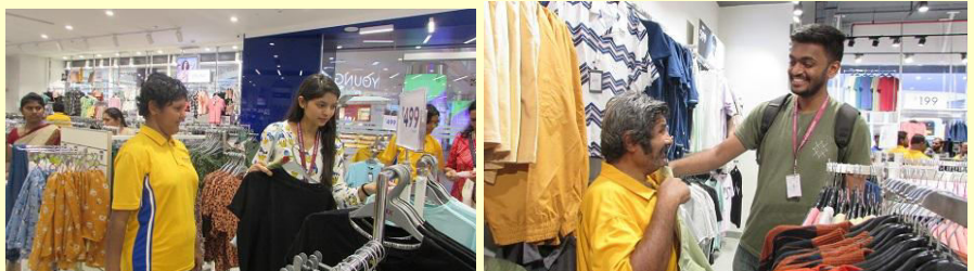
Volunteers from Indira School of Business Studies helping our Friends with the shopping