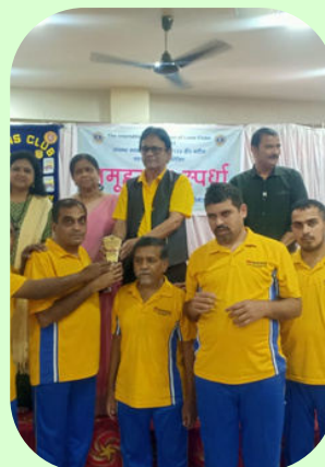
Navkshiti team won the second prize at a group singing contest organised by Lions Club