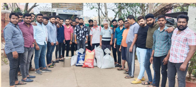
A group of wellwishers supported Navkshiti by fulfilling grocery requirements