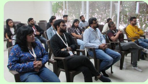
As part of its 10th Foundation Day celebrations, a team of volunteers from Confluxys Pvt Ltd visited Marunji