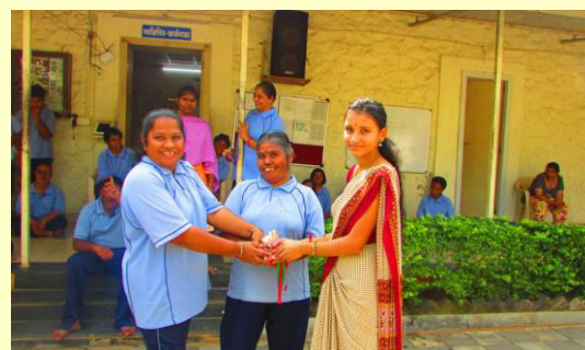
Felicitating the winners at Marunji (Sports Day)