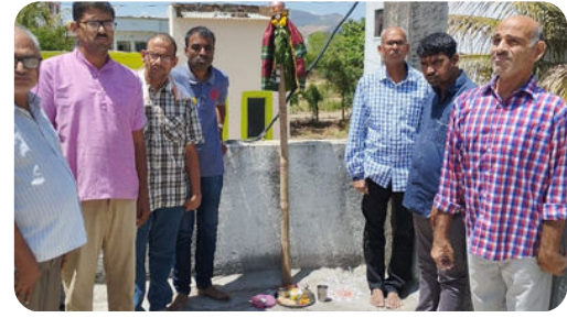
Gudi Padwa at Somatane Unit