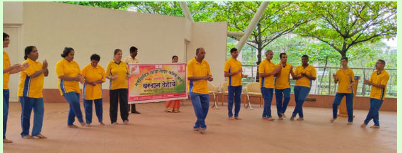
Friends presenting a Street Play at Infosys