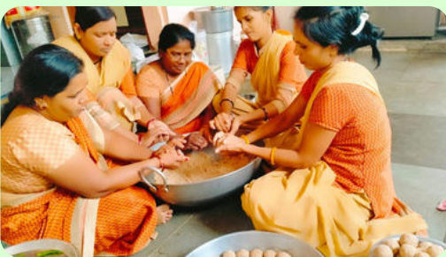
Making delicious laddu for Makar Sankranti