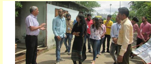
Left: Students attending the Dronalaya course taking a tour of the Marunji campus;