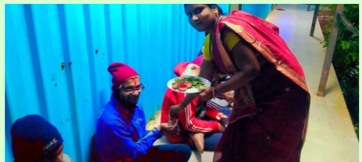
Celebrating Bhai dhoj at Asawali