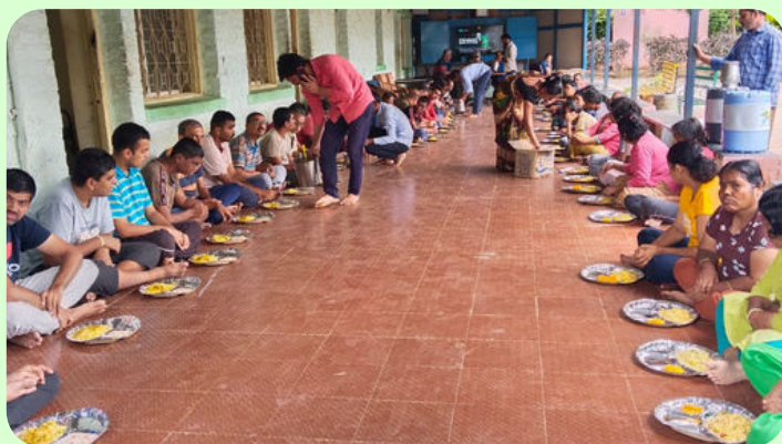
Lunch sponsored by a well-wisher at Marunji