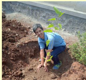
Tree Plantation Drive