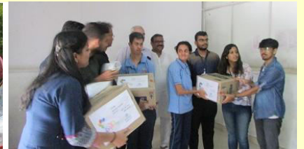
Right: Maheshwari Vidya Pracharak Mandal gave donations in kind to Navkshitij