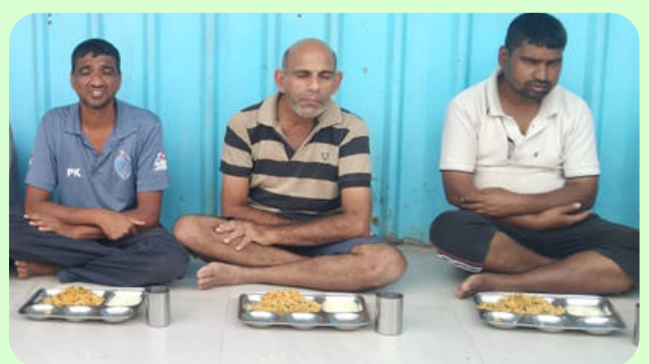
Lunch sponsored by a well-wisher at Asawali