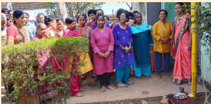
Gudi Padwa celebrated at Marunji Unit