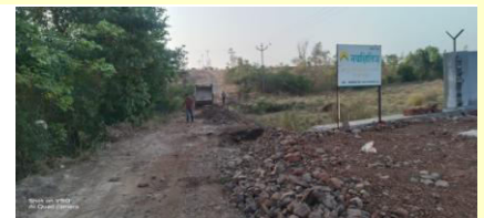
Work in progress at Asawali