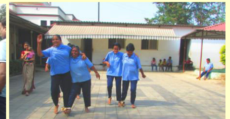
Left: Volleyball match at Asawali (Sports Day); Right: Three-legged race at Marunji (Sports Day)