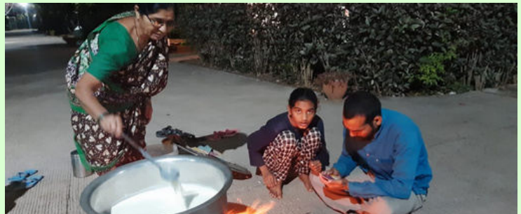
Kojagiri Poornima celebrations at Marunji