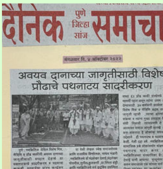
What the press is saying about our Walkathon and Street Play