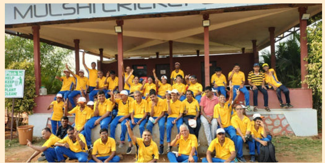
A Sports Day was organized at Mulshi Cricket Ground