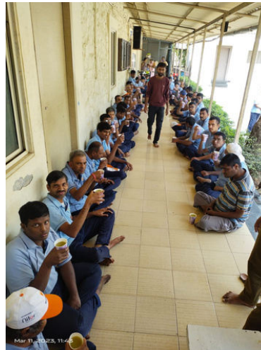
First Sugarcane juice party of the summer