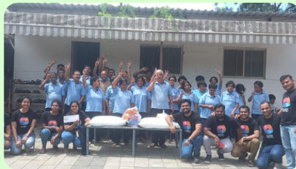
A group of volunteers from Nice System, Hinjawadi