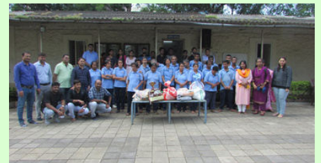
A group of volunteers from Infosys BPM Ltd at Marunji