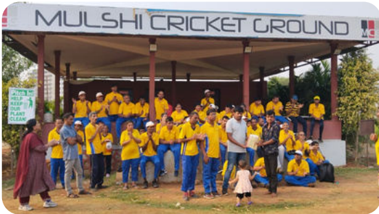
A Sports Day was organized at Mulshi Cricket Ground