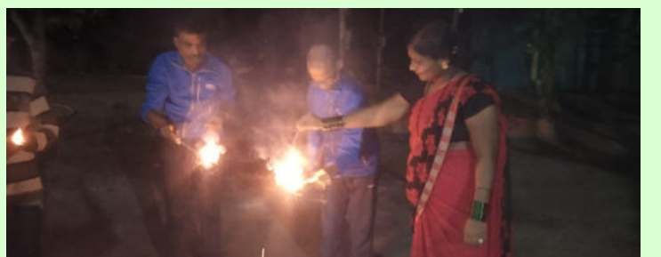
Diwali celebrations at Marunji