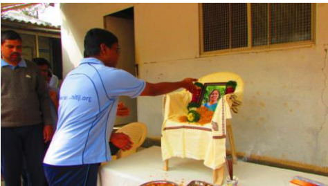
Special Friends at the Prayer Meeting