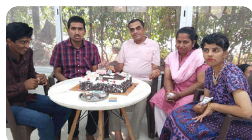
Birthdays celebration of Marunji Friends