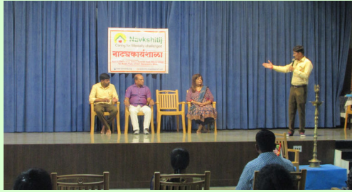
Workshop for special educators and art teachers