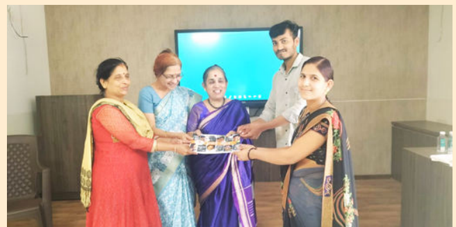
Founder of Sadhana Village conducted a guest lecture for the Caregivers' batch