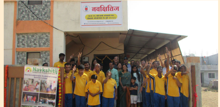
Inauguration of our new satellite centre at Somatne, Pune

Birthday celebrations and Sankranti with gol-poli added to the joy of our special friends and staff. Our Foundation Day, scheduled for January 21, had to be rescheduled due to an unavoidable circumstance. It will now be held on February 5. We are sure that the delay will only help us put up an even better show.