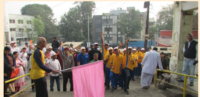
Flagging off Parvati Hill Climbing competition