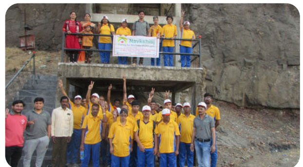
At Firangai Devi, for our monthly trekking