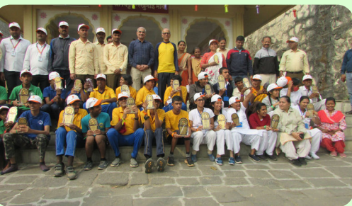
The proud winners of the Parvati Hill Climbing Competition 2023