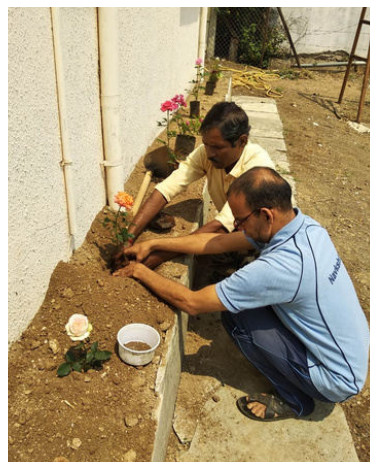
Beautification of Somatane unit is being done by our Special Friends and staff members