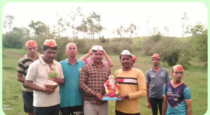
Ganapati Visarjan at Asawali