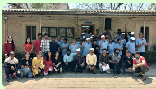
Interns from Indira Institute of Management, Pune at Marunji