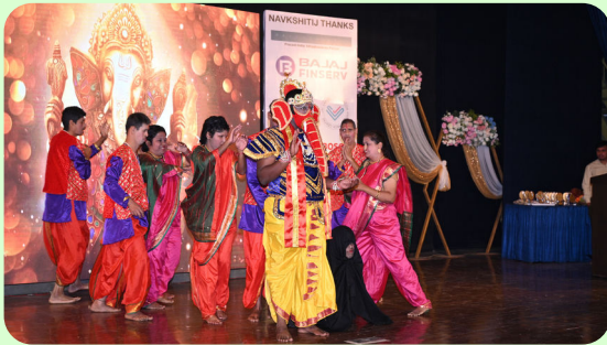
Ganesh Vandana by our Friends on Foundation Day