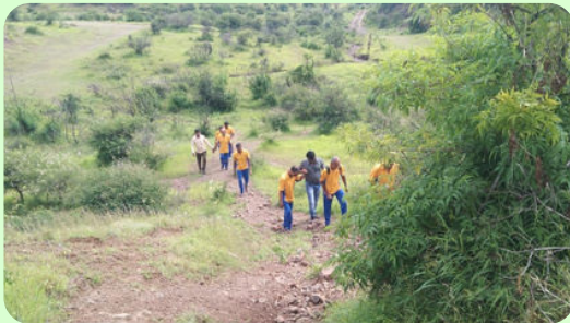
Asawali Friends on a trek to Pandavdara