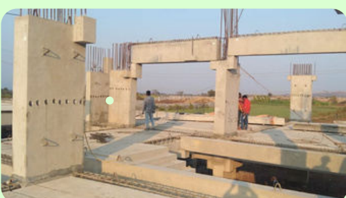
Construction at Asawali