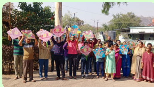
Ready for the kite flying on Makar Sankranti