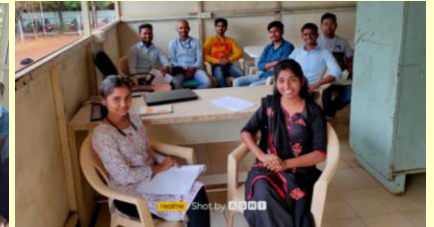
Right: Some of the interns at the Workshop area