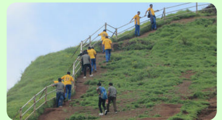
Trek to Naneghat by Marunji Friends