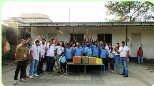
Volunteers from Hexaware Technology at Navkshiti