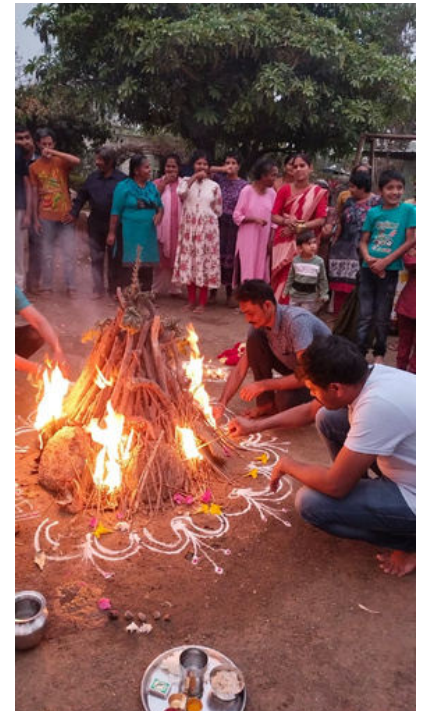
Holika Pujan at Marunji Campus