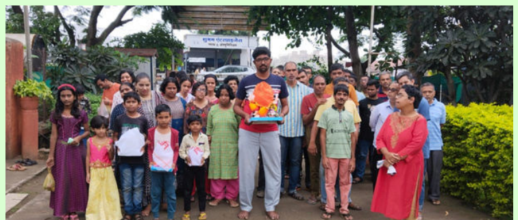
Bringing home Lord Ganesha