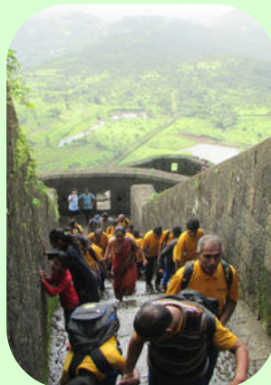
Monthly trek to Lohagad