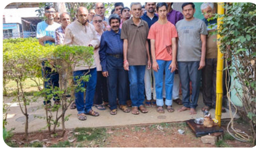
Gudi Padwa celebrated at Marunji Unit