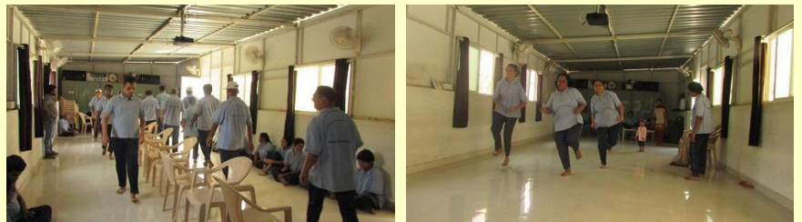
Monthly Sports Day events