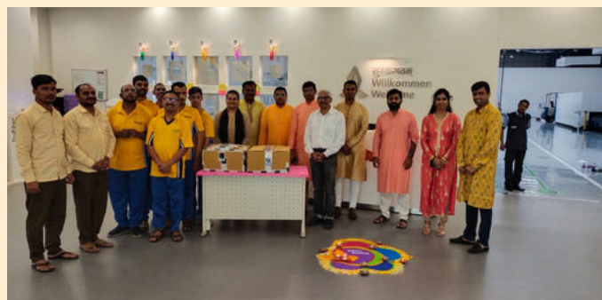
Our Friends at Trumpf India Pvt Ltd for Diwali Pooja