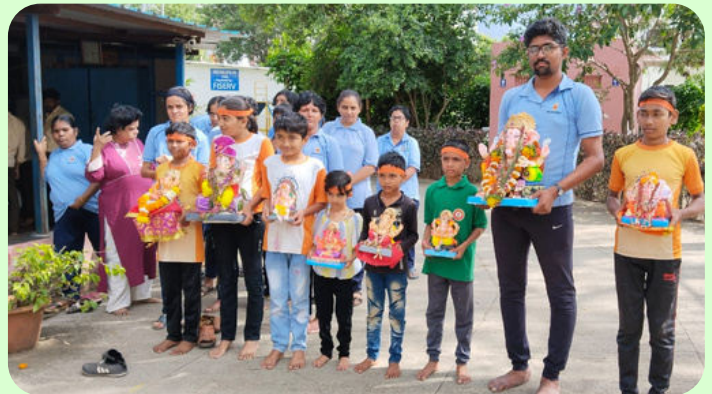
Ganapati Visarjan at Marunji