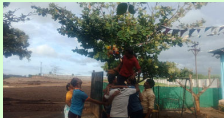
Dahi Handi at Asawali