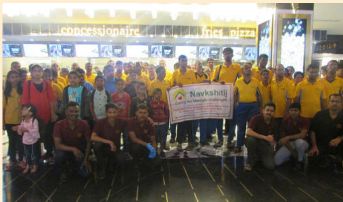
At PVR Studio in Grand Highstreet Mall, Hinjawadi, for the special screening of Bramhastra

The Grand Highstreet mall at Hinjawadi invited our Friends and staff for the screening of the movie Bramhastra to mark the auspicious launch of PVR cinema. After the movie, there was a warm meal waiting for us. For this month's trek, our Marunji Friends went to Naneghat and the Asawali group went to Pandavdara on September 25.