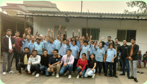
A group of employees from TALKD visiting Navkshiti