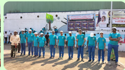
Navkshiti Friends at the national-level limited overs cricket tourney organised by Kamayani, Gokhale Nagar, Pune