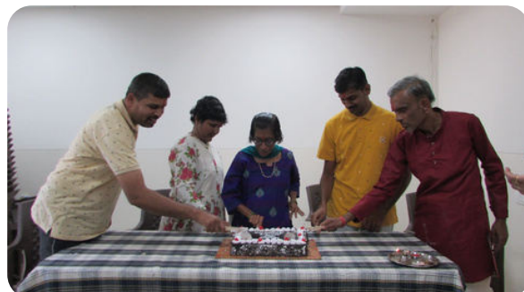
Common birthday party for our February-born Friends