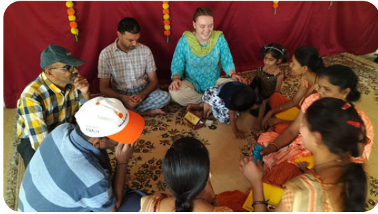
Field visit of Caregiver's batch to Sadhana Village, Paud, Pune