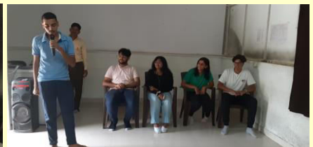
Farewell party for the interns from Vasantao Naik Marathwada Krishi Vidyapeeth, Parbhani (left) and for the interns from UPES, Dehradun (right)