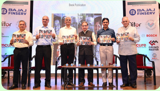
Coffee table book release