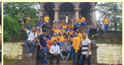
Left: A team of doctors and volunteers from Asian Paints Clinic, Naigon at Asawali; Right: At Shivneri