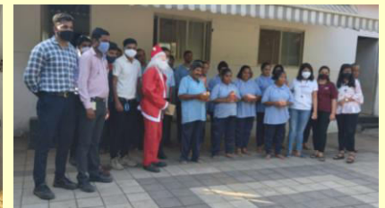
Left: Common birthday party for our December-born Friends; Right: Xmas Day celebrations with a team of volunteers from TATA Motors