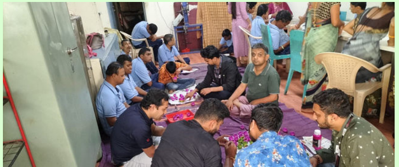
Volunteers from Nitor Infotech at the Workshop, helping our Friends complete corporate orders for the festival season