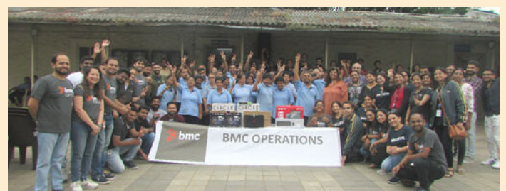
A team from BMC at Marunji

We ended the month with a full-day Trustee meeting, from 9 am to 4.30 pm. At the meeting, we discussed strategies and roadmaps with reference to the ancillary units and the training institute.