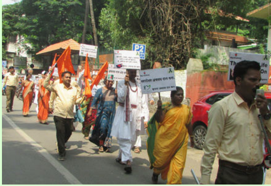
Walkathon down Fergusson College Road