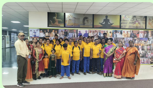
Our Friends participated in Jalosh, a programme organised by the Suryadatta Group of Institutes