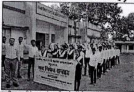
दामजीपुरा। मद्य निषेध सप्ताह के उद्घाटन के लिए निकाली गई रैली। नवोदितवा

सामाजिक न्याय एवं निष्कासन कल्याण विभाग बैतूल जिला में मद्य निषेध सप्ताह मनाया जा रहा है। विद्यमान नवोदित ग्राम उत्थान महिला एवं बाल विकास समिति के द्वारा शिक्षासखंड धोपापुर के हायर सेकेंडरी स्कूल दामजीपुरा एवं हायर सेकेंडरी स्कूल मोहटा में नशा मुक्ति पर सभा-सभों, वाणिज्यिक लाकरीय मेसर्स के द्वारा बताया गया कि बिना प्रसार नशा समाज में बर्बादी का कारण बना हुआ है एवं नशे से ग्रसित व्यक्ति खुद अपने शारीरिक क्षति का शिकार तो है और अपनी परिवारिक आर्थिक स्थिति भी खराब कर रहा है। कई वर्षों के