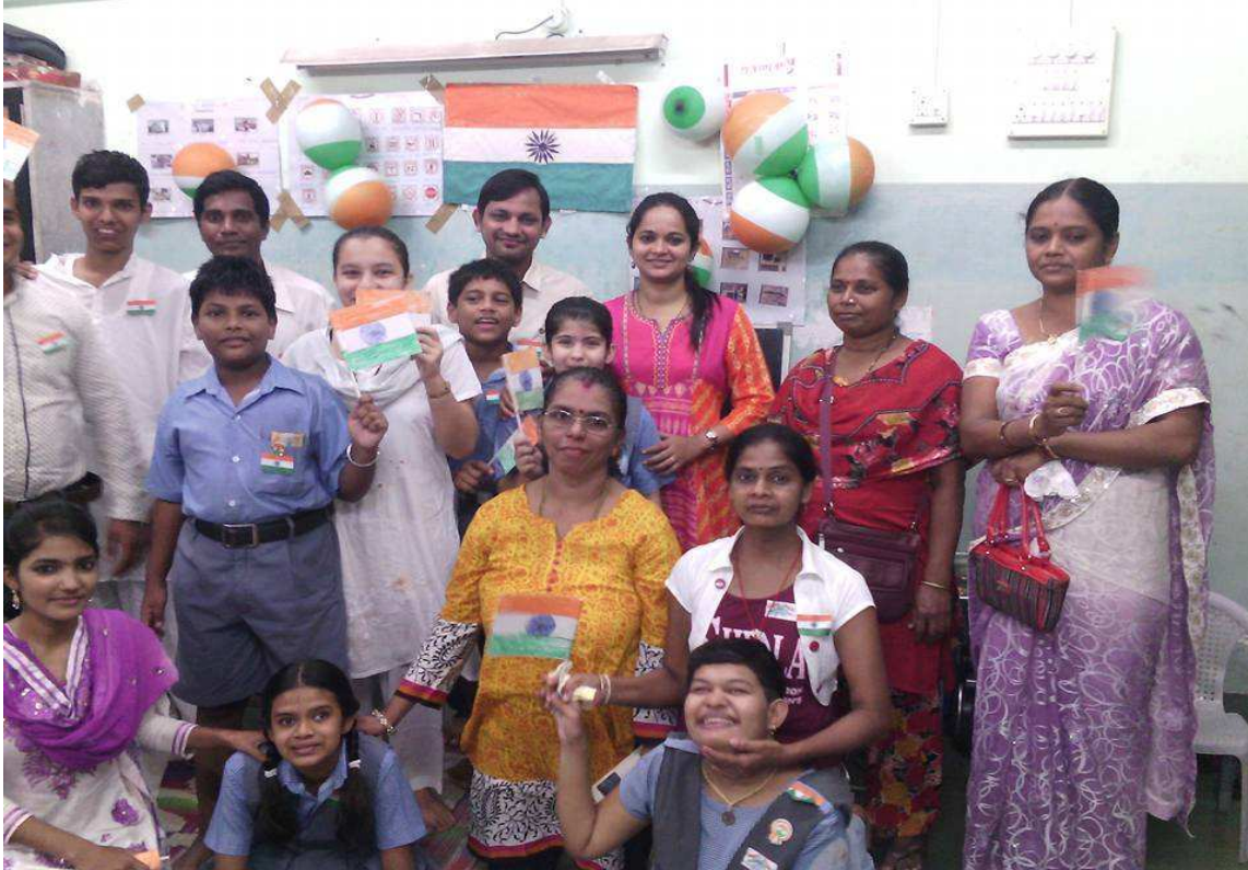
26 th January Republic Day