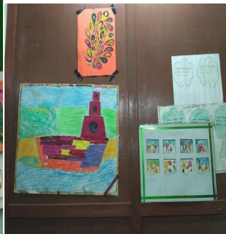
ACTIVITIES CARRY OUT BY SPECIAL CHILDREN WITH THE HELP OF TEACHER AND PARENT