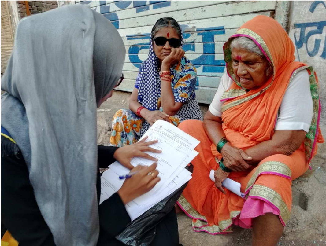
MEDICAL CAMP IN ZAKIR HUSAIN NAGAR /SATHE NAGAR