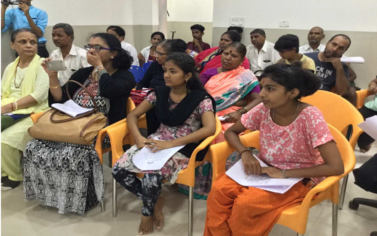
WORLD AUTISM AWARENESS DAY WE CELEBRATED BY ORGANIZING SEMINAR FOR PARENTS & CARE GIVERS OF CHILDREN