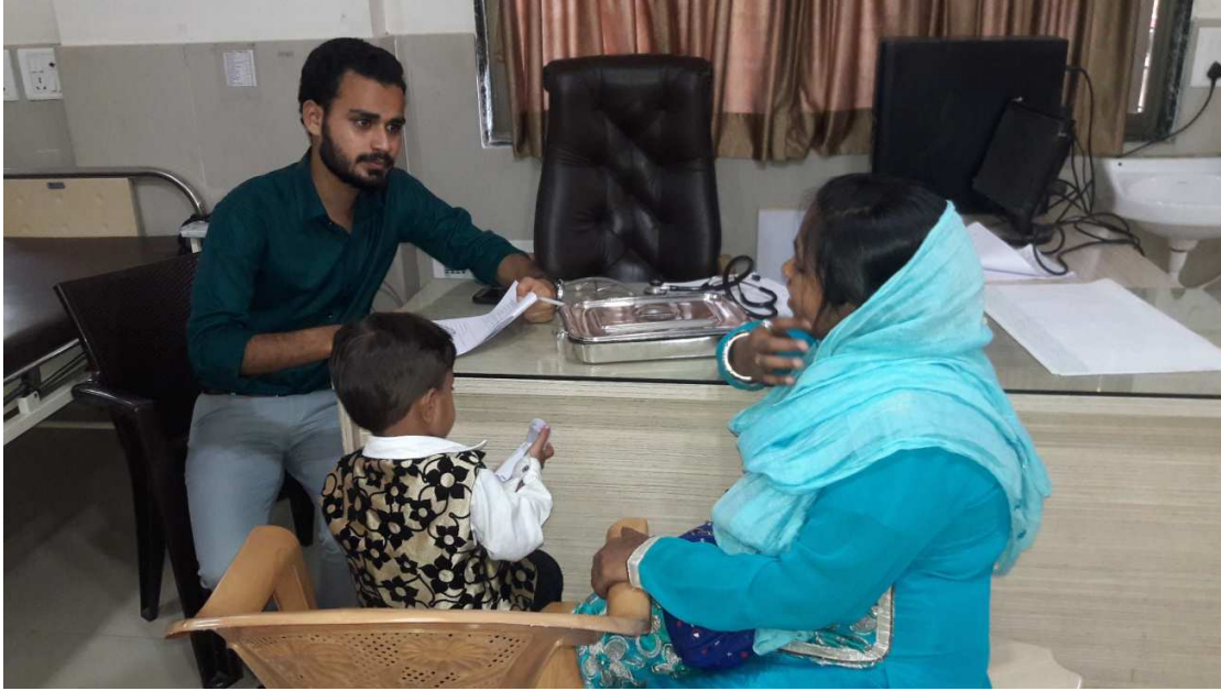
FREE CHILDCARE CAMP FOR CHILDREN WITH DISABILITY & AWARENESS PROGRAM