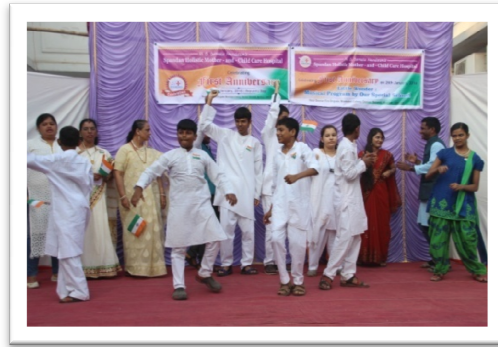
26 th January Republic Day.

OTHER ACTIVITIES:- In all five days of the week we make a time table for extra circular activities after the lunch. Monday - Dance Practise, Tuesday – Cooking Activity like Salad like fruit salad, vegetable salad, Sukha Bhel, Chinese Bhel, Making, Juice making , Wednesday – Outing like take them to the Garden for playing. Thursday – Sports Practise, Friday – Singing & also Dancing. In between we shows Historical , or sometimes entertainment movies. Everyday after the prayer we take Yoga session, exercise, tell about News Headlines of everyday.