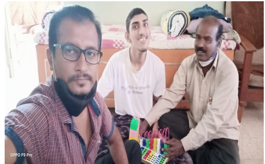
28-10-2020 Meeting was conducted in Sanidhya Special School, Mangalore. Our staff also attended the meeting