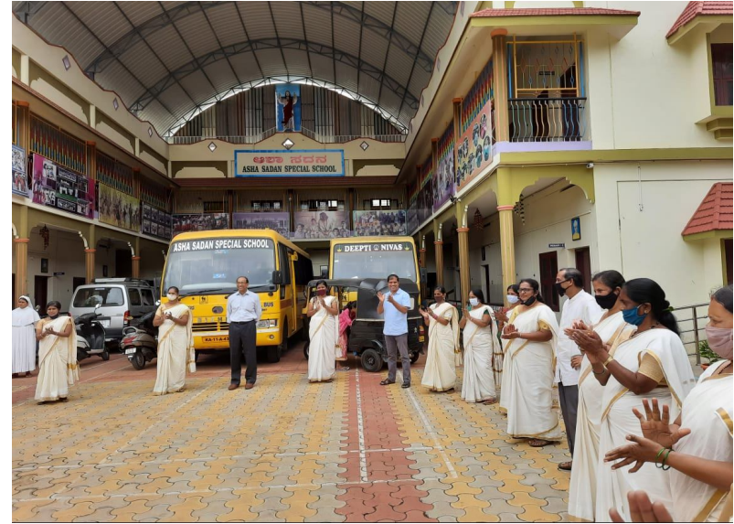
08-09-2020 On the occasion of Teacher Day we went a one day trip to Mahadevapura