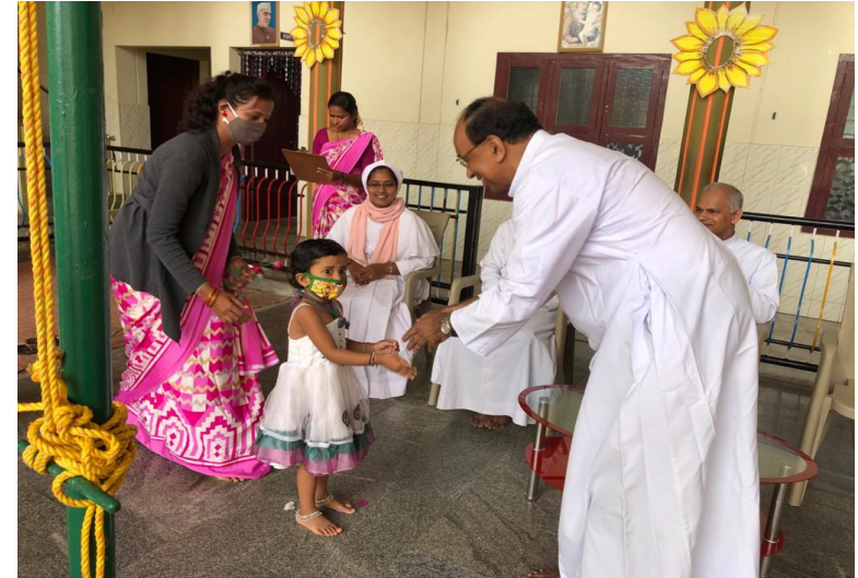
17-08-2020 Food Kit distribution to our school students and Covid-19 affected families