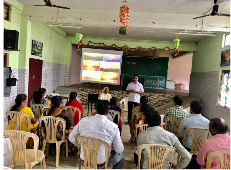
30-11-2020 Teacher of Gundlupete visited to our school and take some suggestion to how to handle the special kids