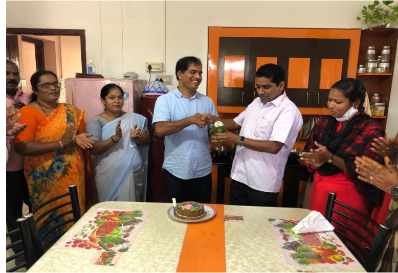
27-11-2020 Special schools of Mandya, give a request letter to increase the honorarium to DC, Mandya