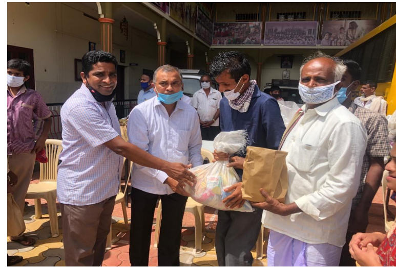
10-08-2020 Mandya Motor showroom was inaugurated from our school students . Mandya DC also presented in this program.