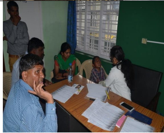
Date:11.06.2018 Place:DDRC Chikmagaluru