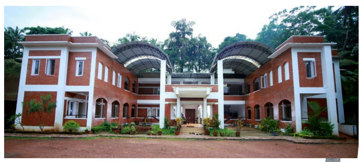
Run By- Navajyothi Charitable Trust