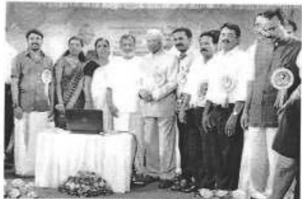
Dr.A.P.J.Abdul Kalam in The Function at Gandhibhavan