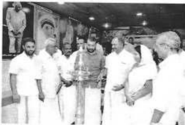
Kerala Assembly Speaker Sri.P.Sreerama Krishnan inaugurating 1 day Gurusandana Sangamam at Gandhibhavan