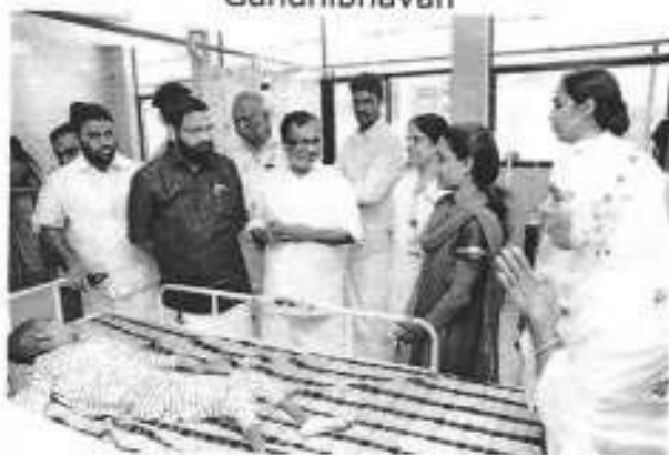
Kerala Minister Sri.Kadakampally Surendran consoles Gandhibhavan inmates during visit to Gandhibhavan