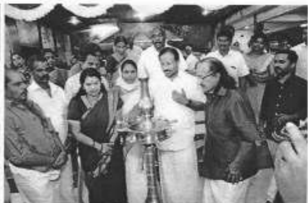
Rajyasabha M.P.Sri.P.Muraleedharan inaugurating 1 day Guruvandana Sangamam