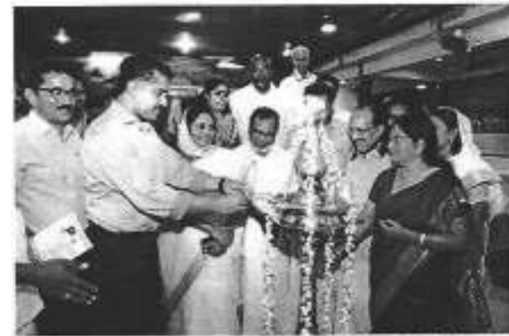
High Court Judge Justice Sri.Raja Vijaya- raghavan inaugurating 3 rd Anniversary of Gandhibhavan District Shelter Home