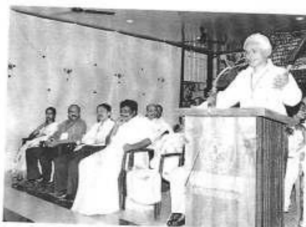
High Court Judge Justice C.N.Rama chandran nair in Gandhibhavan