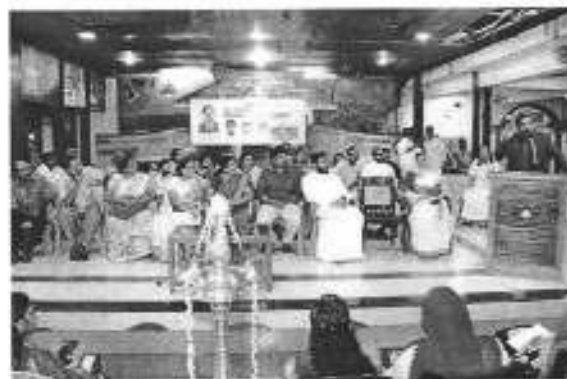
High Court Judge Justice Sri.P.Ubaid inaugurating Mega Lok Adalath in Gandhibhavan