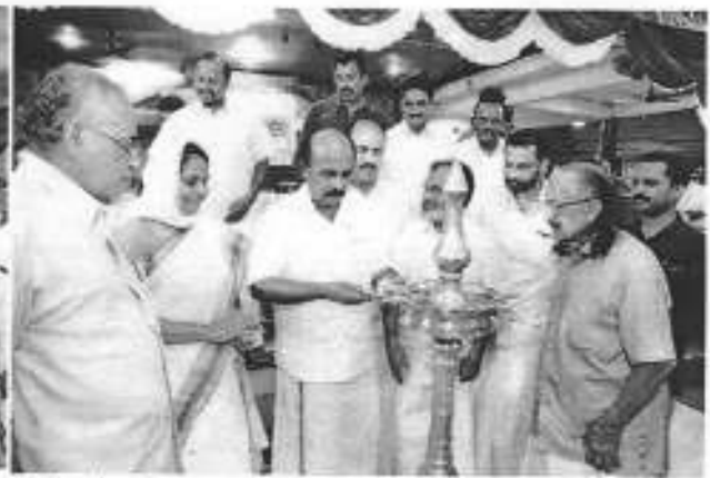
Kerala Revenue Minister Sri.E.Chandrasekharan inaugurating the Guruvandana Sangamam