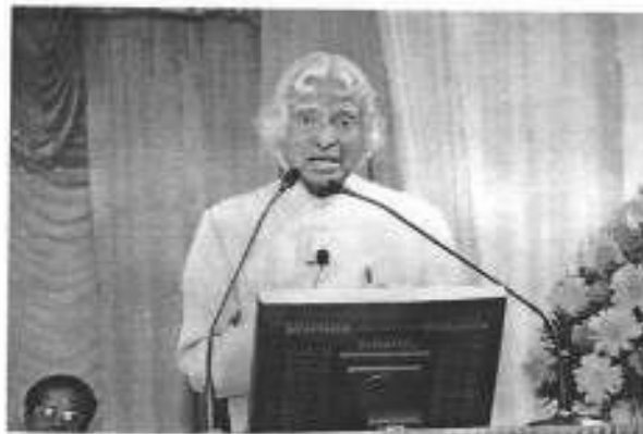
Speech of Dr.A.P.J.Abdul Kalam in Gandhibhavan during the visit