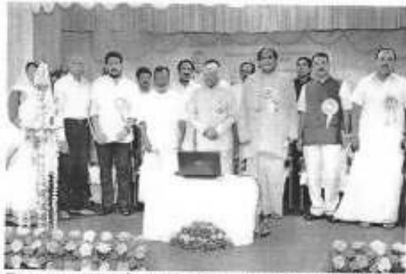
Former Pres' ident of India Bharat Ratna Dr.A.P.J.Abdul Kalam in a function at Gandhibhavan.