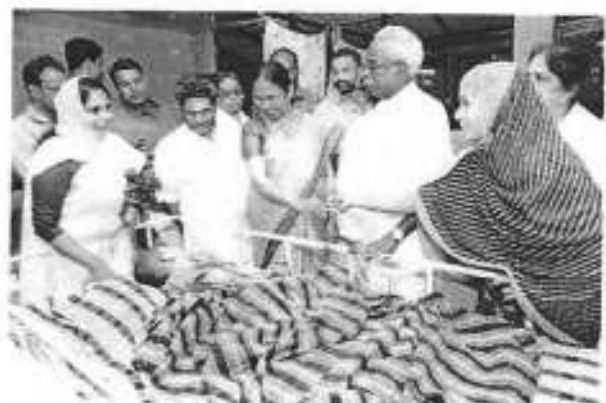
Kerala Minister Smt.K.K.Shylaja Teacher interacted with inmates in during the visit to Gandhibhavan