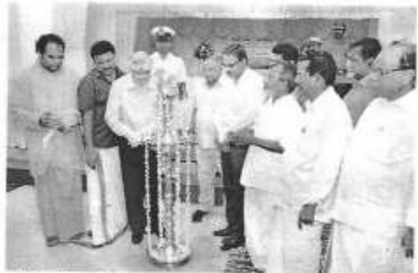
Kerala Governor Justice P.Sadasivam inaugurating 1 day Guruvandana Sangamam in Gandhibhavan