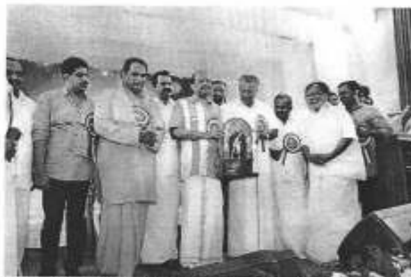
Kerala Chief Minister Sri.Pinarayi Vijayan presents Gandhibhavan Honour to Lulu Group Chairman Padmasree M.A Yusufali