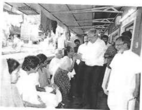
High Court Judge Justice K.M.Joseph with Aged Mothers in Gandhibhavan