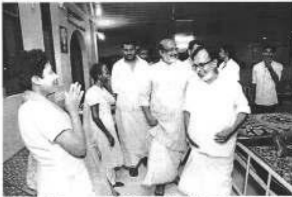
Kerala Finance Minister Dr.Thomas Issac visiting one of the Wards in Gandhibhavan