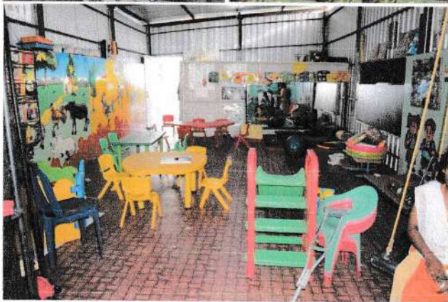
Activity & Learning Room

Ashadeepa established Disha cum Vikasa Center included the Sensory Park and Playground is an inclusiveness for children with disabilities play space created and developed to meet the physical needs of individuals for the welfare of Children with Autism, Cerebral Palsy, Mental Retardation and Multiple Disabilities.