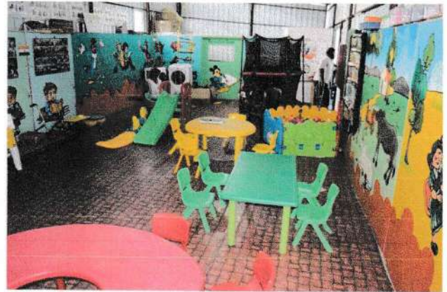
Activity & Learning Room