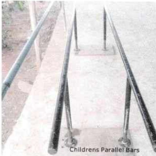
Childrens Parallel Bars