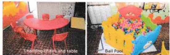
Learning chairs and table