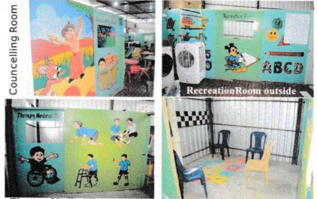
Therapy Medical Room outside