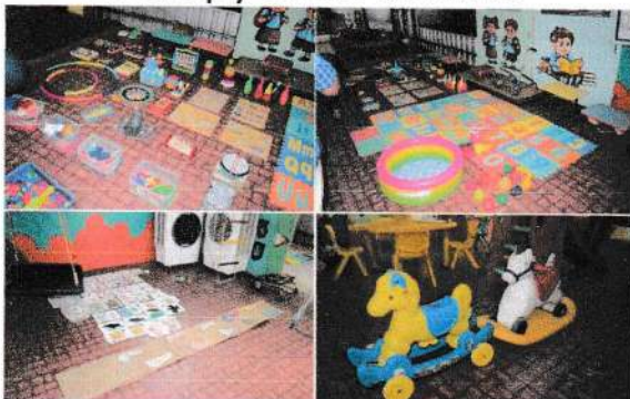
Learning Activity Materials