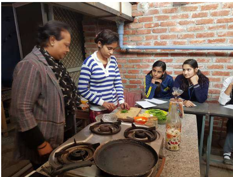
Cooking classes started at Tender Heart