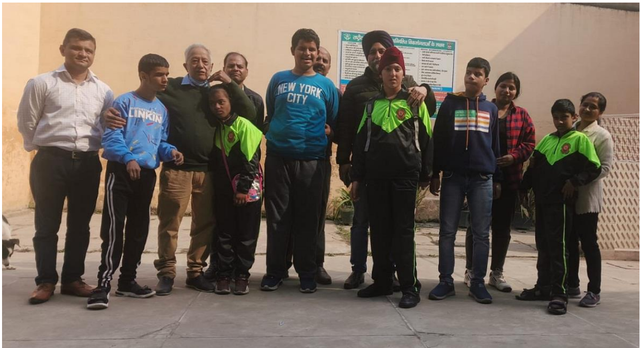
Exams March 2023