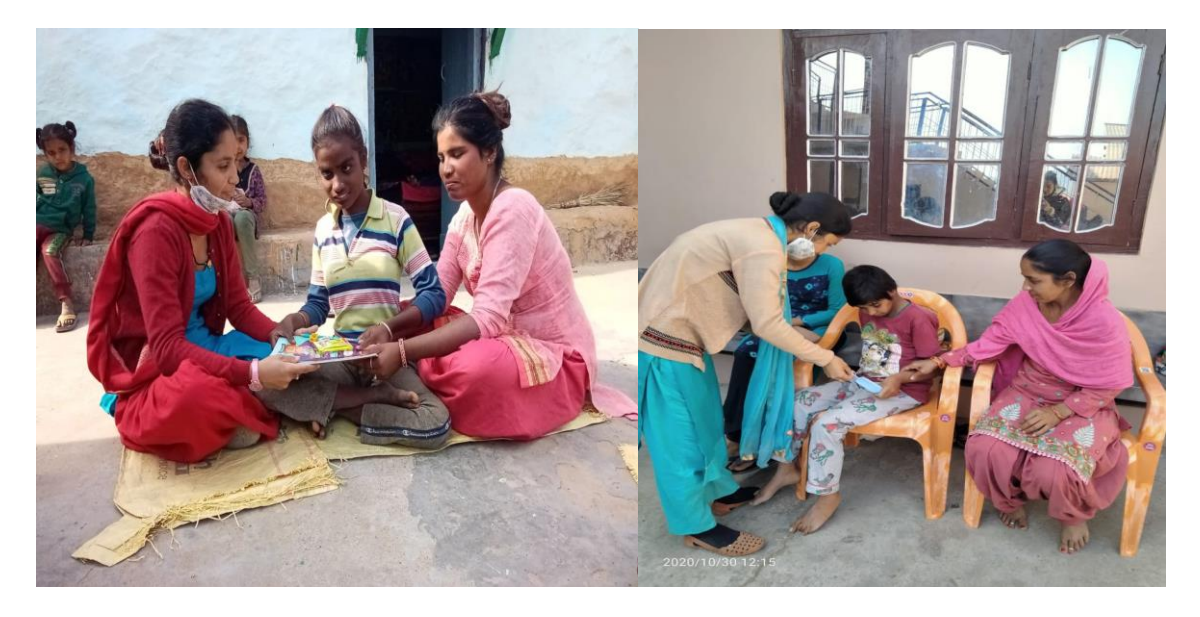
Home based activities of children

Academics Skills are taught to the extent that the child can read/write counting, alphabets, his/her name, recognize the colors, currency notes identification and very minor addition and subtraction. Now because these skills do not come naturally to the child, so some of the skills are to be repeated on a daily basis. Name and addresses of the child concerned are taught to perfection.