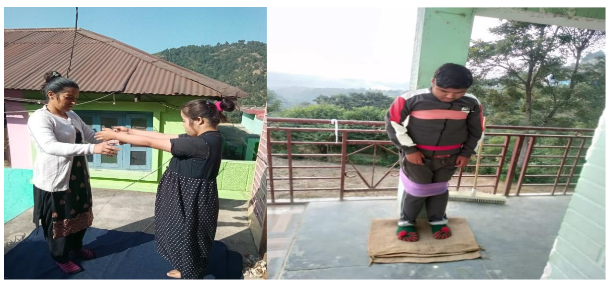
Physiotherapies in home environment

In the year 2020-21 a total number of (twice a week)_visits were made by the therapists.(03 sticks) 02(wheel chairs) appliances were distributed.