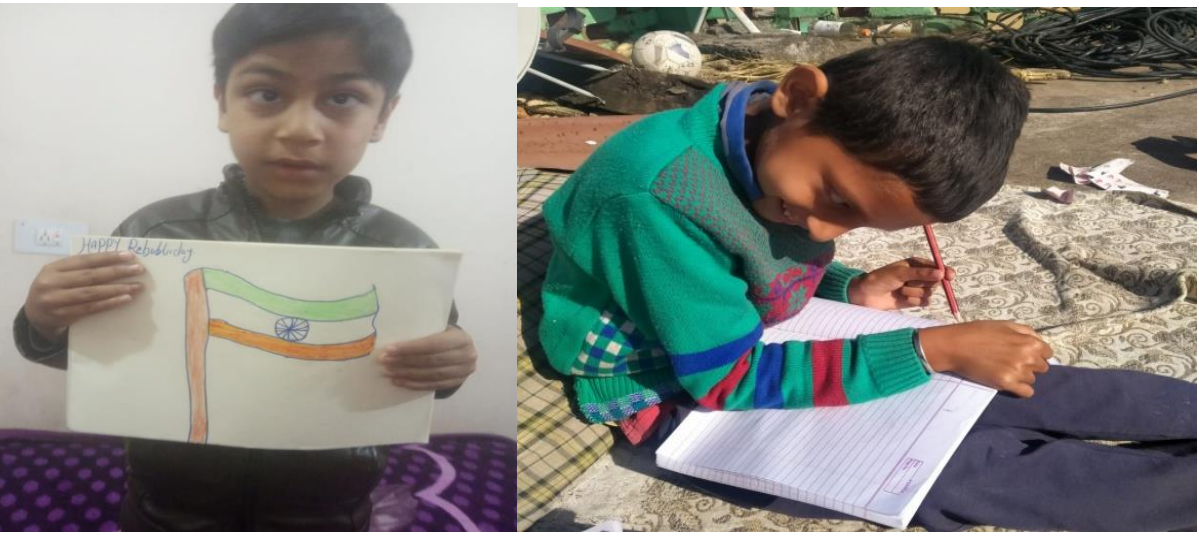
Day care activities in our Disha cum vikas centre (performed in home due to covid-19)