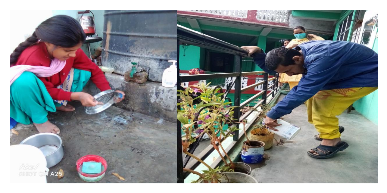
Vocational activities for children in our Disha cum vikas centre (in home environment)