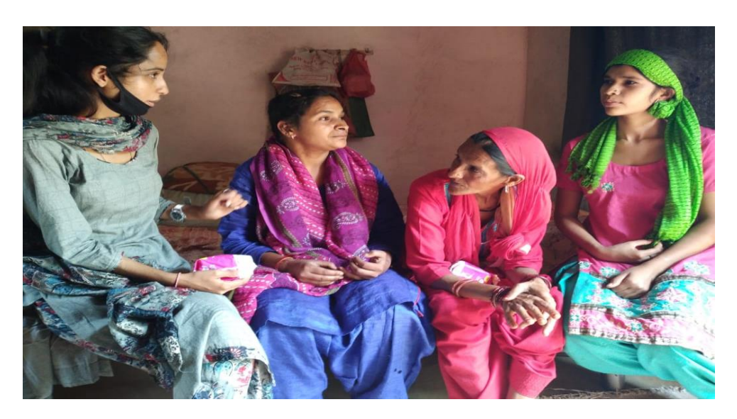
parents counselling by care giver along with cwsn and other adlosence girls.

As all the children enrolled with us get the benefit of seeing the physiotherapist, our special educators learn the exercises to be given to our friends at home and the same is taught to their parents/guardians so that the exercises are maintained in regularity. Each child/ adult has a different set of exercises