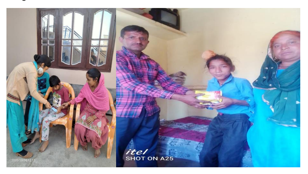
Day care activities in our Disha cum Vikas centre conducted in home due to covid

due to pandemic and then after lock down after march 2020 we have to impart day care centre services by alternative mode of knowledge and skill transformation with the help of demonstration by teaching learning material through their parents /guardians , whatsapp group has created for children, we give assignments in group according their ability, guardians help them in completion of assignment, then parents /guardians upload these activities on group, our spl. Educators and our whole NGO team check these activities and give appreciation and further direction for improvement. Due to covid -19 spread we are not in position to call the children in centre, but we are visiting child home, following all precautions, suggested by administration time to time. We are trying to bridge the gap, arising due to regular physical absence of child. In situation, where the cases of covid -19 in particular village are existing, we are avoiding, our home visits, in that particular village until zero cases. We are also conducting Google- meet for parents counseling and physiotherapy. We are providing free medicine to the needy children, those who are on regular medicine.