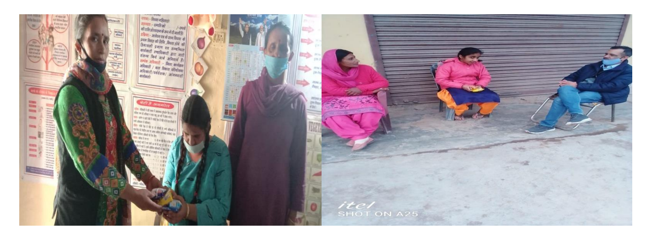
Visit of the Director VO in homes after short break in lock down in villages

1.a Concept Formation: naming and matching, generalization and similarly identification of colors in daily use.