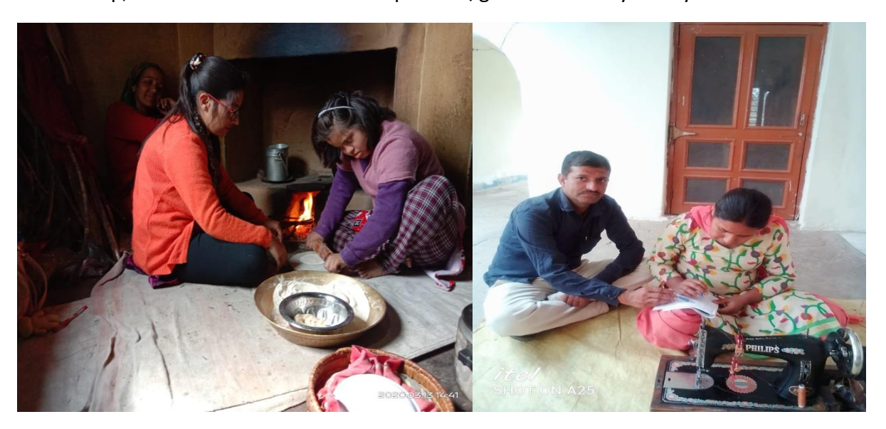
Under the supervision of care givers

After introducing this activity in the year 2010 in the field of candle making, stitching, making of sweet boxes, paper bags, pickle making, painting, greeting cards making etc and after we had send these to the Ministry of Social Justice and Empowerment and we have a place reserved in the Delhi Haat for our artifacts to be displayed. Each child goes through a similar procedure or identifying his/her interest to choose a vocation and believe us this process takes a really long time, but after we finally select a vocation to a certain child we stick to improving it in a very slow manner so that the process is thoroughly understood by the beneficiary and he /she makes it his/her ultimate habit. Some of our friends have now converted these vocational educations into small professions. This year, we try to emphasis on home based activities in rural set up, so that child can assist their parents /guardians in day to day activities.