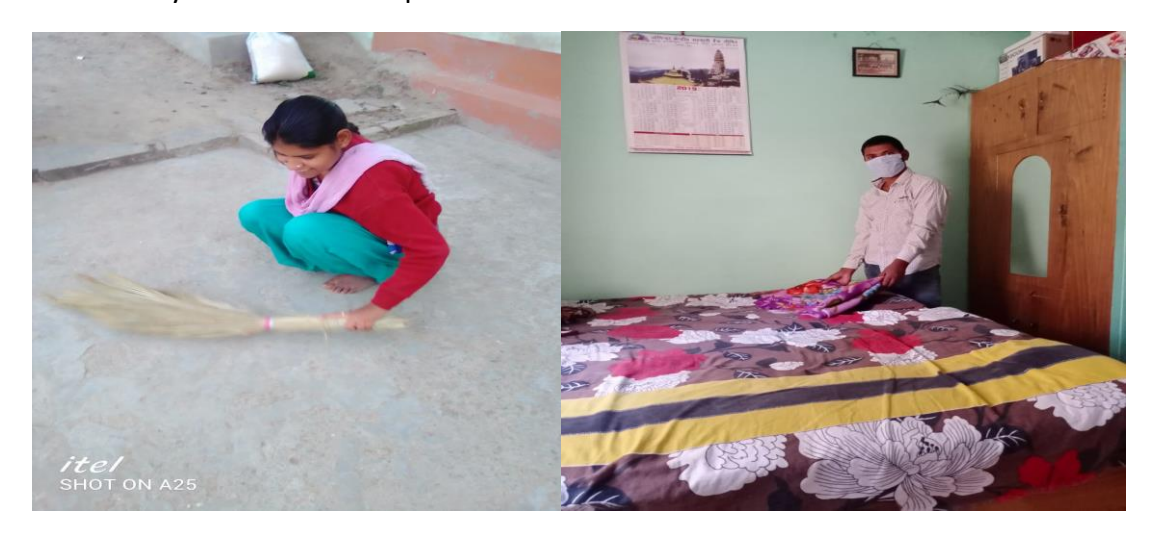
Domestic activities by children under the supervision of parents

Domestic Skills are about necessities to be accomplished during a routine days work and they are equally important wherein the household names of things are recited on all meetings so that the child is helpful doing household work. In most of the cases the child now helps the parents in booming the house, fetching water from a nearby source, cleaning the utensils, working in the fields etc. Watering and how to maintain the small kitchen garden is what additionally we have taken up in 2018-19.