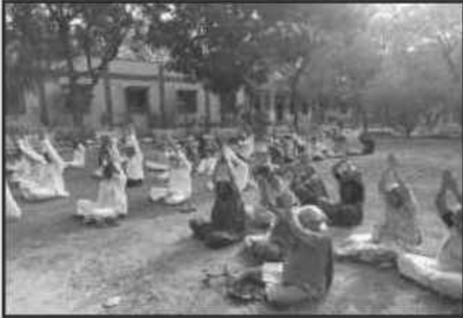
Yoga Shibir at Old Age Home - Bhachau Centre 21-06-2022 on the Occasion of International Day of Yoga.