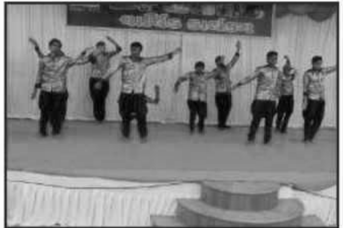
Dance Performed by Our Divyang Children in Annual Function at Divyang Vidhya Vihar held on 25-12-2023.