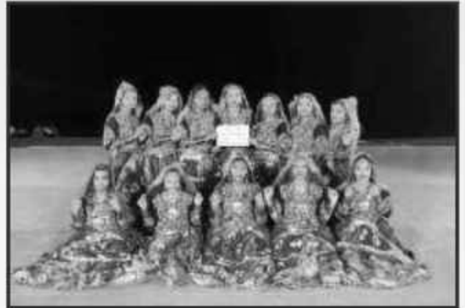
Our Divyang Children Participated in Garba Competition on the Occasion of Apni Navratri festival at Mandvi Beach held on 05-10-2022.