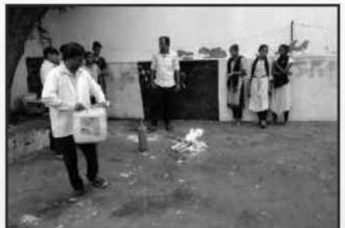
Training of fire safety was given at Lakadiya Centre.