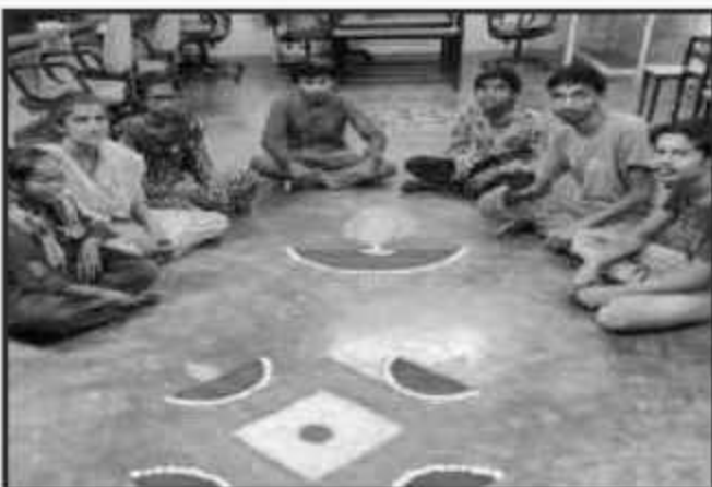
Rangoli Competition was organised at I.T.C. & D.R.C. Centre.