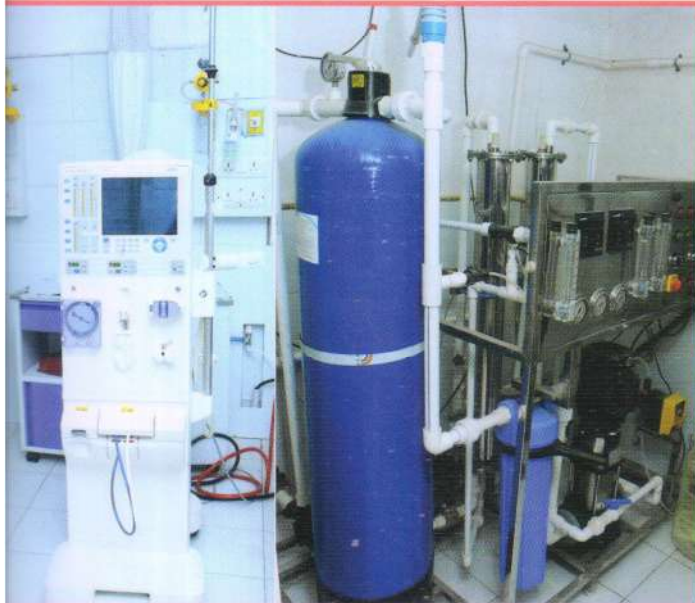
Smt. Ilaben and Dr. Arvind Shah Hemo Dialysis Unit