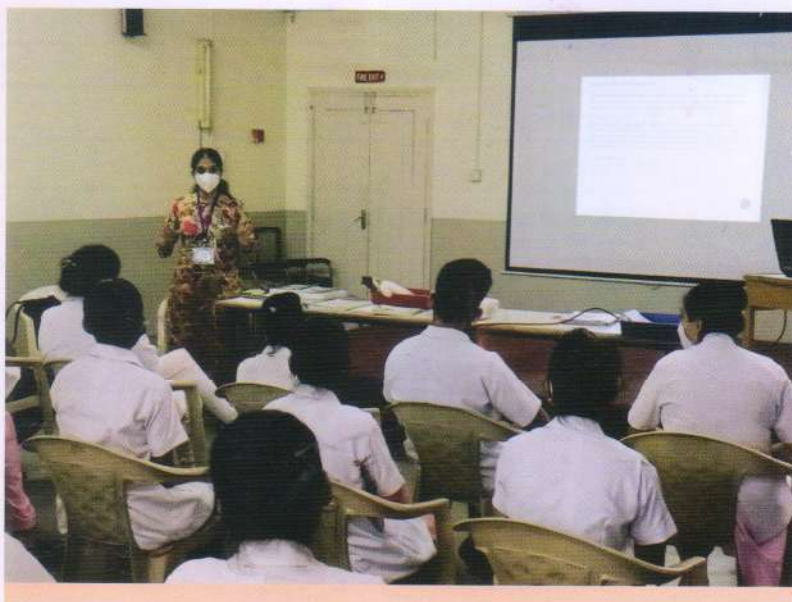
Interactive Workshop on Child Life & Child Development Programme with Nurses was conducted on 06/10/2021.