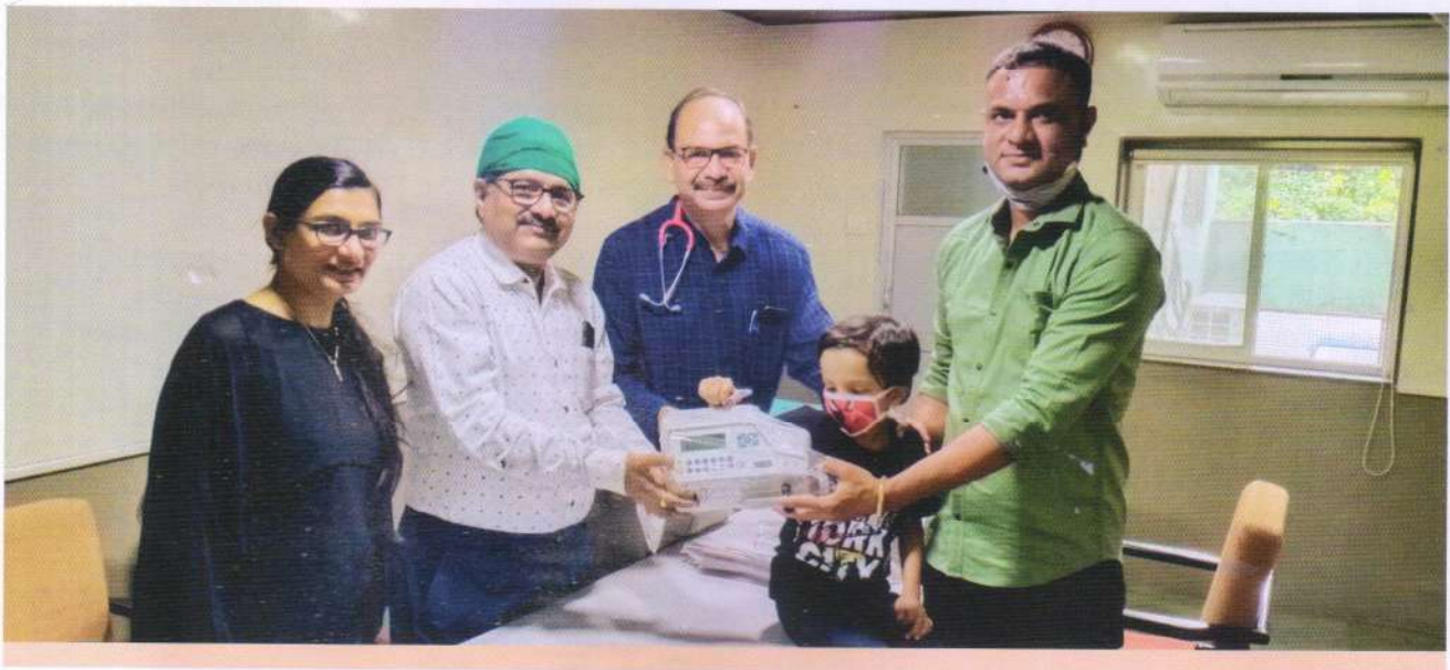
Gratitude expressed by satisfied parents of a patient