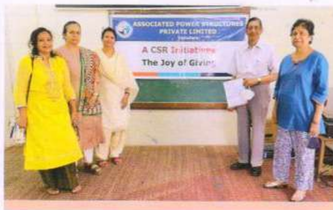
Associated Power Structures Pvt. Ltd. supports our Pediatric Cancer patients and Shri Jalaram Blood Centre

Medical Care Centre Trust is ever grateful to Health Officers of Govt. of India, Health Department of Gujarat State, Health Office of Vadodara Municipal Corporation and donors who have helped us in various ways during the year 2021.