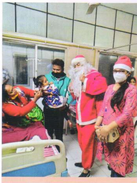
Various festivals were celebrated so that the admitted children do not miss the fun.

Program) at KGPCH is striving to become an integral part of the hospital providing services for psychosocial wellbeing of children in healthcare settings by providing the 4 Ps: Play, Psychological preparation for medical procedures, Pain management and Parent & family support and guidance.