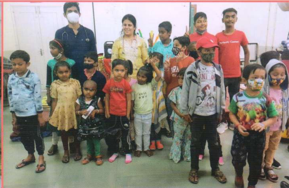
Celebration by Little Brave Pediatric Cancer Survivors.