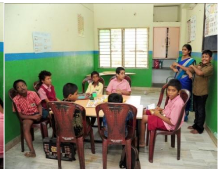
Pre - vocational