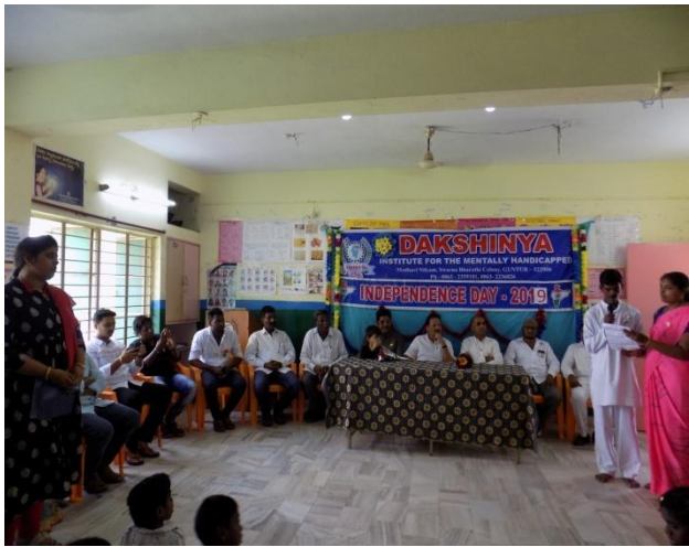
73 rd Independence Day Celebrations – 2019 at Dakshinya Institutes