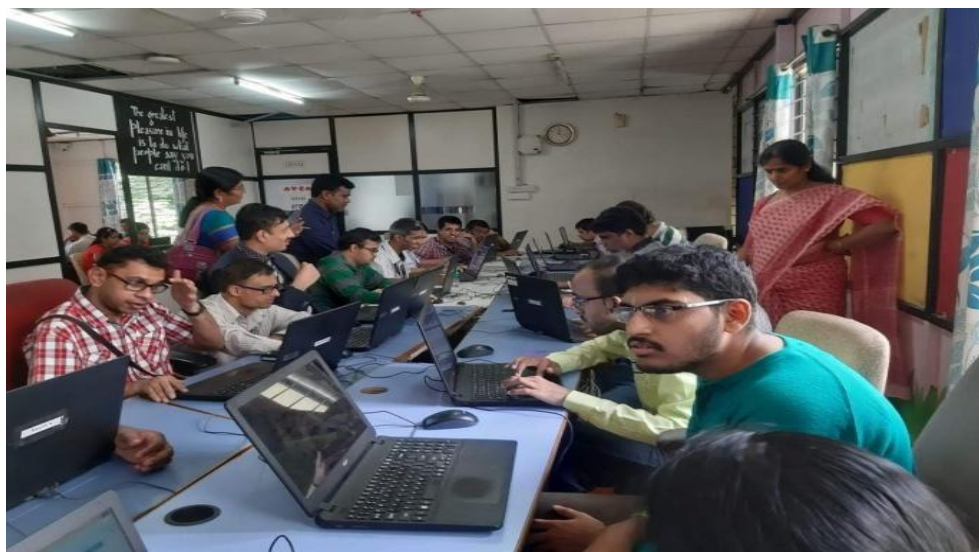
Participation of Dakshinya Divyangjan at AMBA Training Programme held at Bangalore.