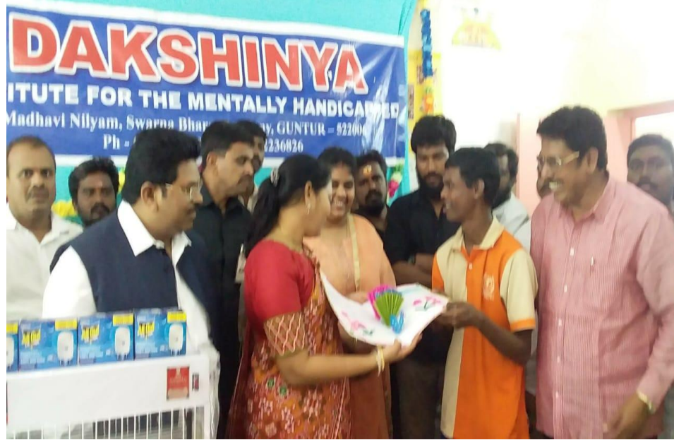
Greeting Wishes by Dakshinya Divyangjan's, on the eve of Birthday Celebration Smt. Mekathoti Sucharitha, Hon'ble Minister of A.P.,