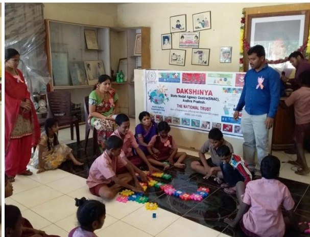
On April 2 nd , 2019 – World Autism Awareness Day at Dakshinya Campus