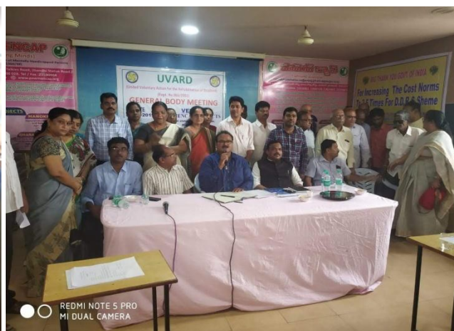
Participation of Dakshinya Member at UWARD General Body Meeting, Hyderabad.