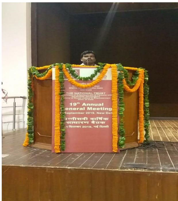
Participation of Dakshinya Member at 19 th Annual General Meeting, The National Trust, New Delhi