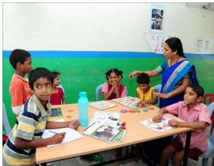
Pre – primary