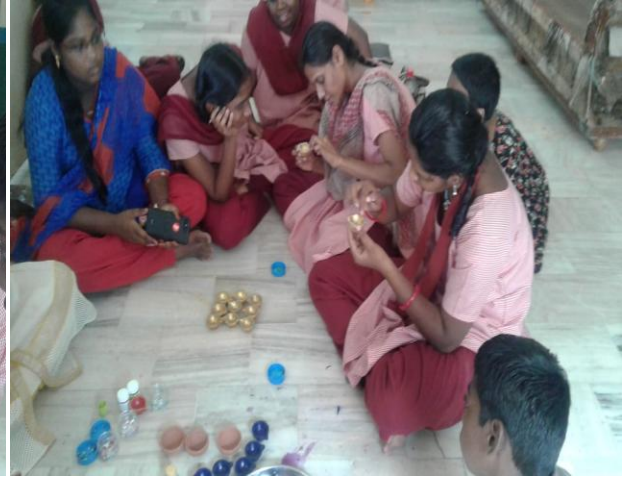
Making of colourful Diwali Lamps by our Divyangjan