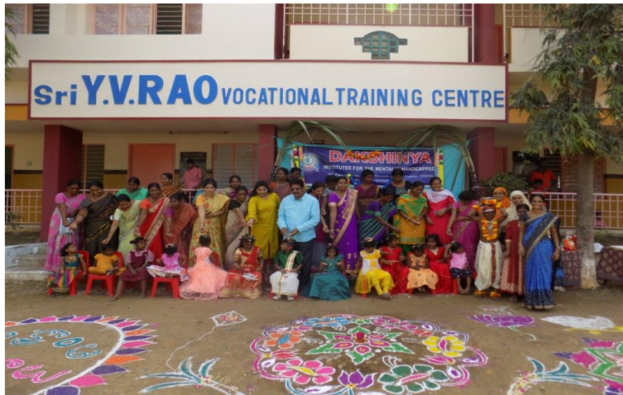
SANKRANTHI SAMBARALU – 2020 at Dakshinya Campus