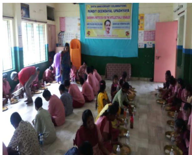
Pt. Deendayal Upadhyaya Birth Anniversary Celebrations at Dakshinya Campus