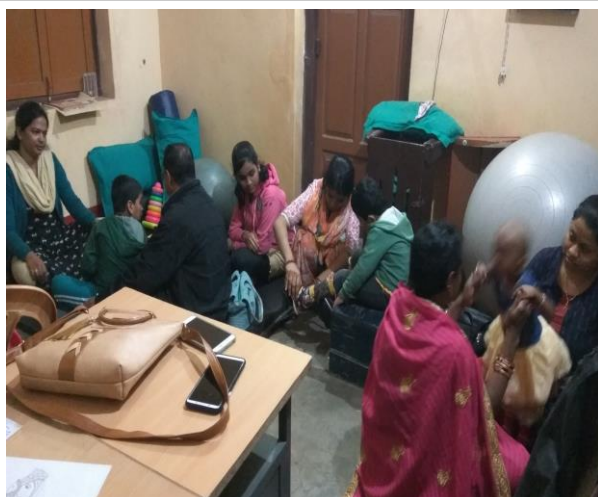
ADL Training at Resource Centre