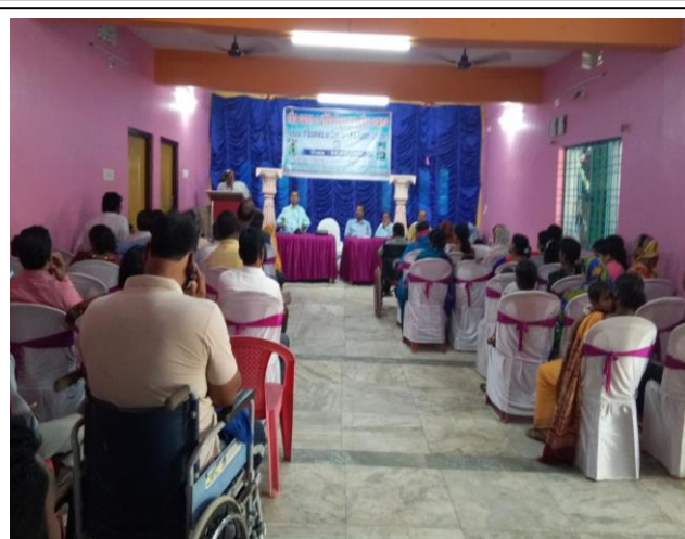
Workshop on Cerebral Palsy & Autism