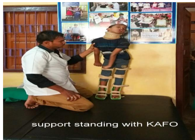
Orthosis Support to Cerebral Palsy Child