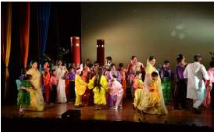
Organizing Annual Function—participation by students with Mental Retardation, Down Syndrome, Autism & Multiple Disability