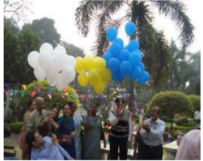
Participation in Badhte Kadam - an initiative by National Trust in Kolkata