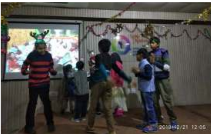
Students with Mental Retardation, Down Syndrome, Autism and Multiple Disability celebrating at a Pre-Christmas Party