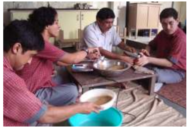
Providing Vocational Training to students with Mental Retardation, Down Syndrome and Autism