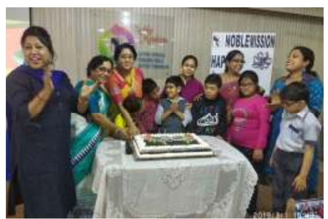
Celebrating Foundation Day along with students with Mental Retardation, Down Syndrome, Autism and Multiple Disability