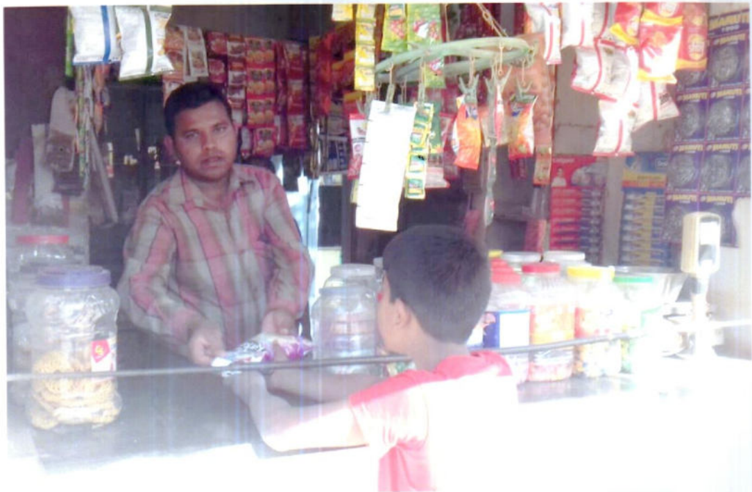
Small petty shop