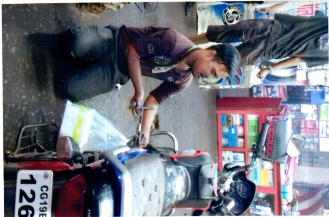
Ex student in the garage