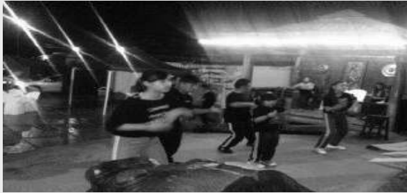
Random pic: CWSN students performing a choreography.