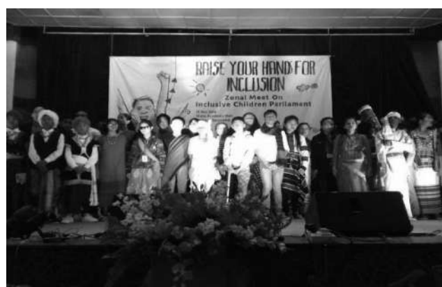
Children Parliament participants with their cultural performance during Press conference.