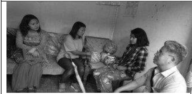
Field visits by CBR team.