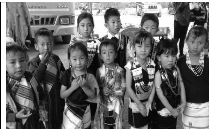
Cherry Blossoms School students getting ready for the cultural show during 31 st October 2018.