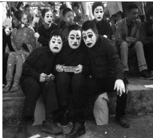
Pantomime performance by CWSN students of CBS during the occasion.