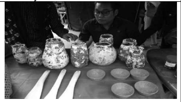
Mhonchumo (VI student) displaying his crafts for sale.