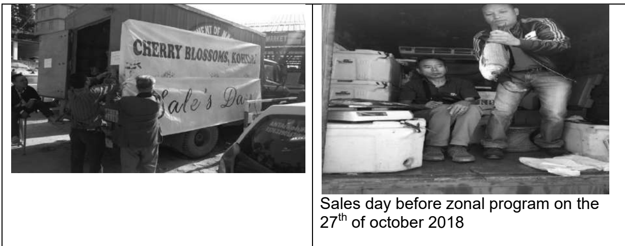
Sales day before zonal program on the 27 th of October 2018

Activity: SALES DAY in aid of RAISE Your Hands for Inclusion campaign. The PTA and teachers carried out a Sales Day at PHQ Junction, Kohima, Nagaland, for fundraising to aid the campaign. Major participation was witnessed among the parents and they tirelessly contributed their labour and time for the day to help the fundraising.