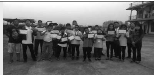
CWSN students winning laurels for the school at various International and National Special Olympics/festivals in 2018