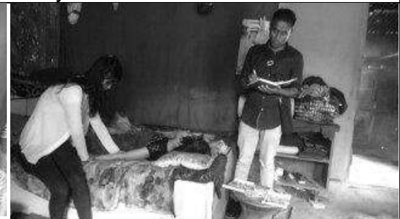
Physiotherapy session during home visits by CBR team.