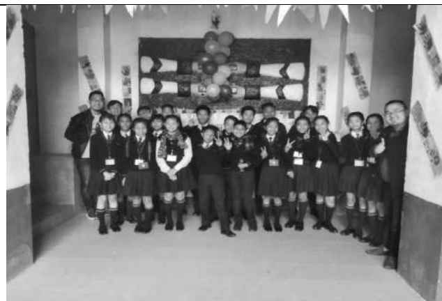
One of the schools from Kohima participating in the Inclusive Singing Competition. (insert: Chandmari School Kohima)