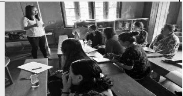
Staff training by key teachers (conducted once every month) on inclusive education and on disability.