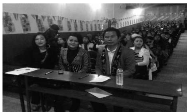
Judges during the Inclusive Singing Competition