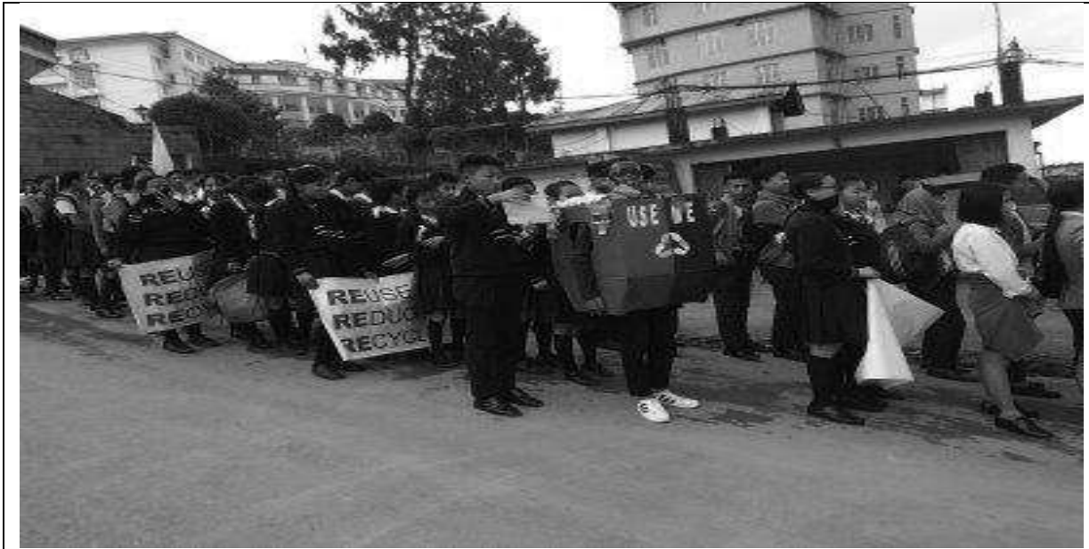
World Environment Day 2018