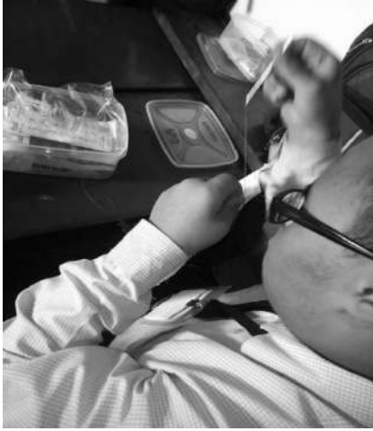
(ID students participating in the art competition (top 2 photos), Id students sitting in group learning to sew (Lower 2 photos))

ATTENDEES: CBS ID students, 2 teachers, 2 key teachers