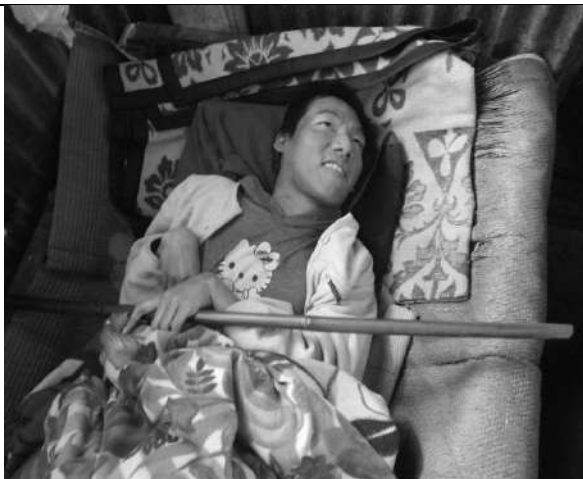
Identified Pwd By CBR Team.