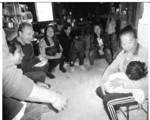
Interaction With Parents Of CwDs During The Same Visit In October 2018