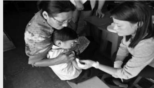
Rubella Vaccination drive in the school.