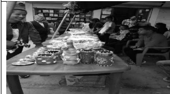
Sales Day October 2018: Org by CBR DPO's.