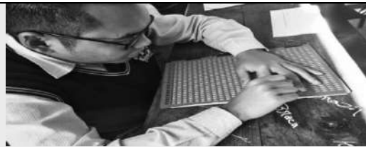
A Visually Impaired (VI) student writing his exams using braille.