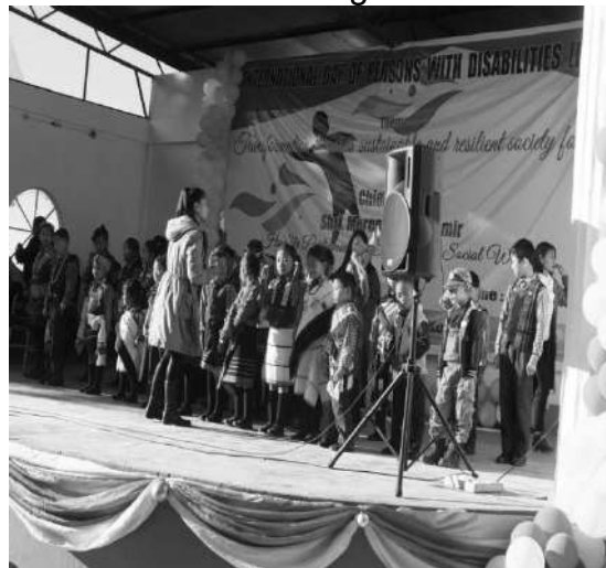
Cultural show during the occasion