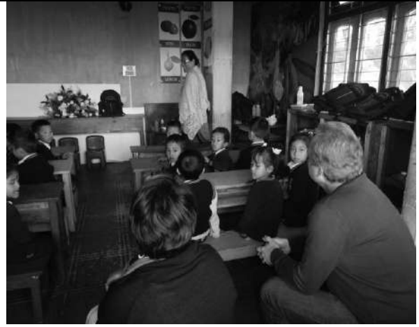
Observation Of Classroom Learning By LFW At Cherry Blossoms School, Kohima During The Same Visit.