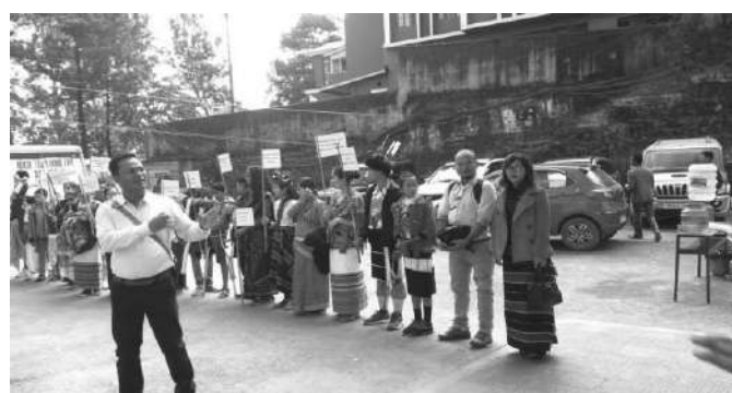
Partners schools of RAISE NE from Assam, Meghalaya, Manipur, & Tripura lined up during 31 st October Zonal campaign on 'RAISE Your Hands for Inclusion' program held at State Academy Hall Kohima.