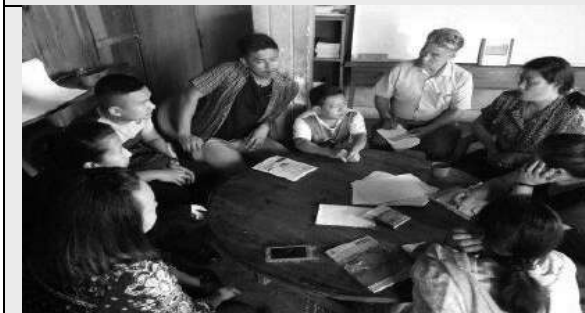
Pic of October 2018 Discussion/meeting of cbs staffs held on the last day of every month.