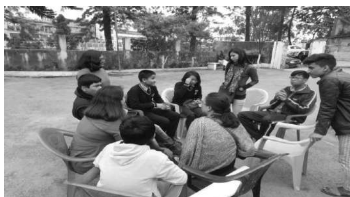
Children's Parliament session during 29 th October 2018.