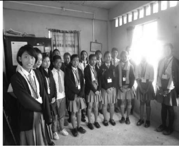
SSA School Aradura, Kohima, Students Posing For A Picture During The Visit By LFW, CBR Team & Raise Key Teachers.