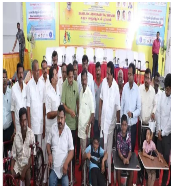
Shine school beneficiary receiving wheel chair