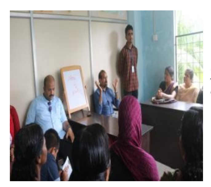
(US NEST CARE FOUNDATION VISITED NEST AND TAKEN CLASSES FOR PARENTS OF NEST CHILDREN)

(DISRTICT EDUCATIONAL OFFICER VISITED NEST ON 13.07.18 IN CONNECTION WITH NIARC HI SCHOOL REGISTRATION )_