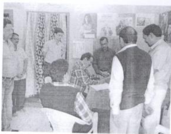
DEPUTY SECRETARY DEPARTMENT OF SOCIAL SECURITY & EMPOWERMENT OF PERSONS WITH DISABILITIES, GOVT. OF ODISHA, BHUBANESWAR