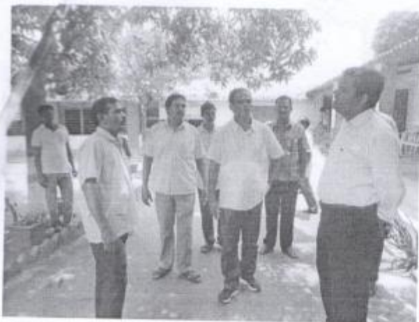
SJ. NITIN CHANDRA, PRINCIPAL SECRETARY DEPARTMENT OF SOCIAL SECURITY & EMPOWERMENT OF PERSONS WITH DISABILITIES, GOVT. OF ODISHA, BHUBANESWAR