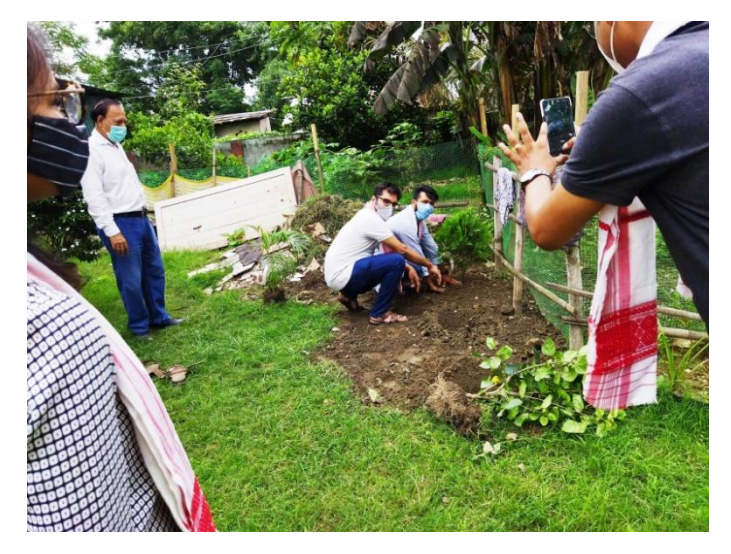
30 July – Lions Club Elite Organized Go Green Project, planted saplings donated grass cutting machine.