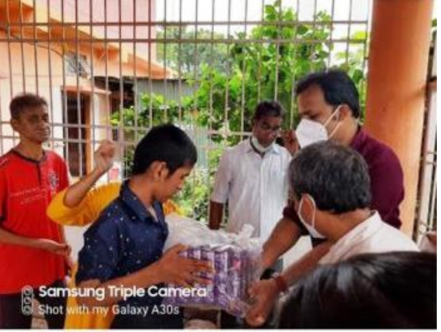
12^{\text{th}} August – Income Tax Dept organized VAN MAHOTSAV at PASS emphasizing importance of nature .