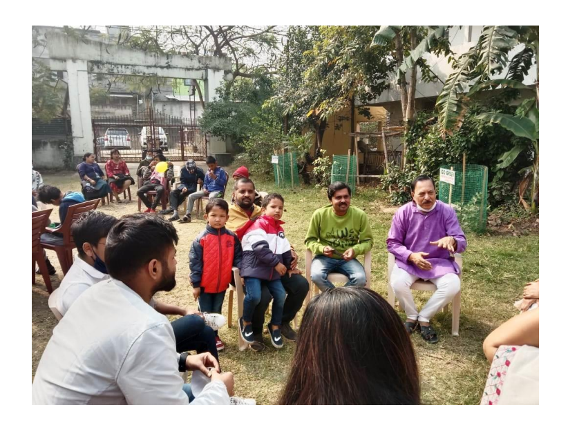
26 January - Lions Club ' Umang ' Celebrated Republic Day At PASS,