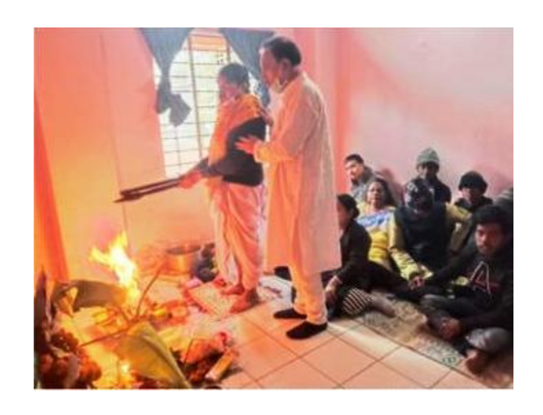
5<sup>th</sup> February - Saraswati Puja at PASS,

18tn March - Festival of colors - holi was celebrated at PASS,