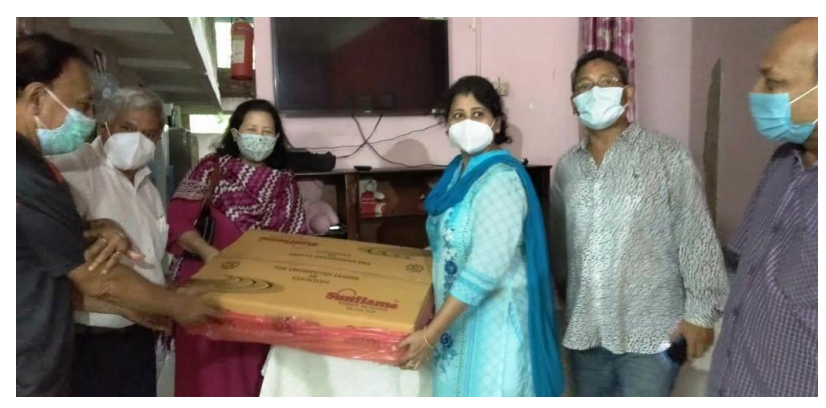
26 June – (COVID) 2^{\text{nd}} Dose Vaccine camp. PRERONA I.A.S Officers Wives Association visited PASS and donated many useful things also.