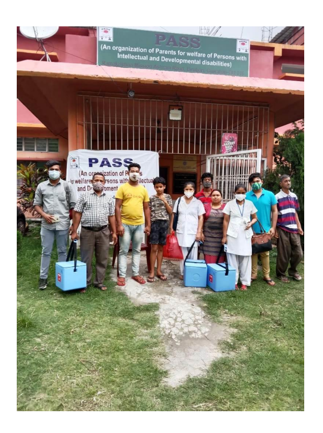
18tn May - ( COVID ) first dose vaccine camp at PASS.