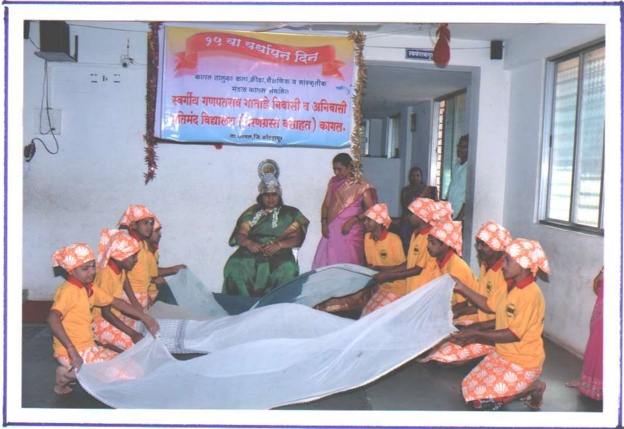
Cultural Program - 20 Jan 2018.

Late Gampatru Gatade Residential and Non-Residential school (Project affected colony) Kagal Tal-Kagal Dist Kolhapur state-maharashtra