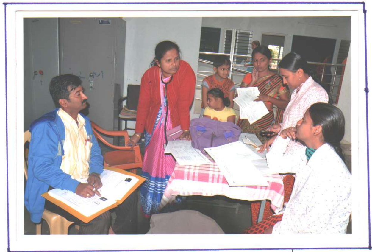
Medical Check-Up Camp- 2018, 3 rd Aug.