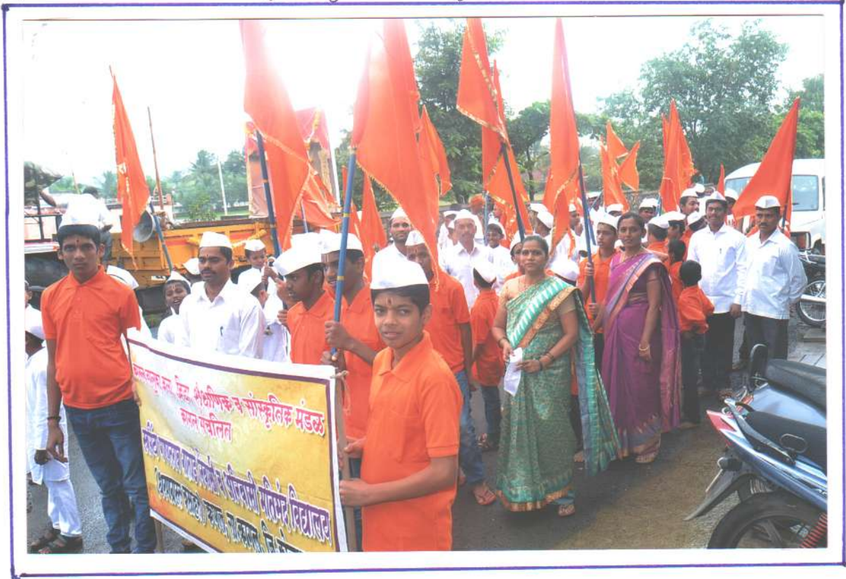
Aashadhi Ekadashi - 26 July - 2018.

Late Gampatrou Gutade Residential and Non-Residential school (project affected colony) Kajeel Tal-Kajeel Dist-Kolhapur state-Maharashtra