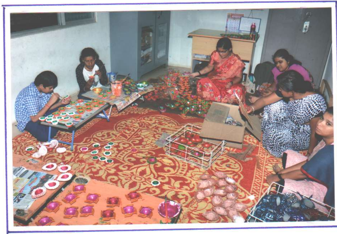
Diwali Lamp making. 2018.