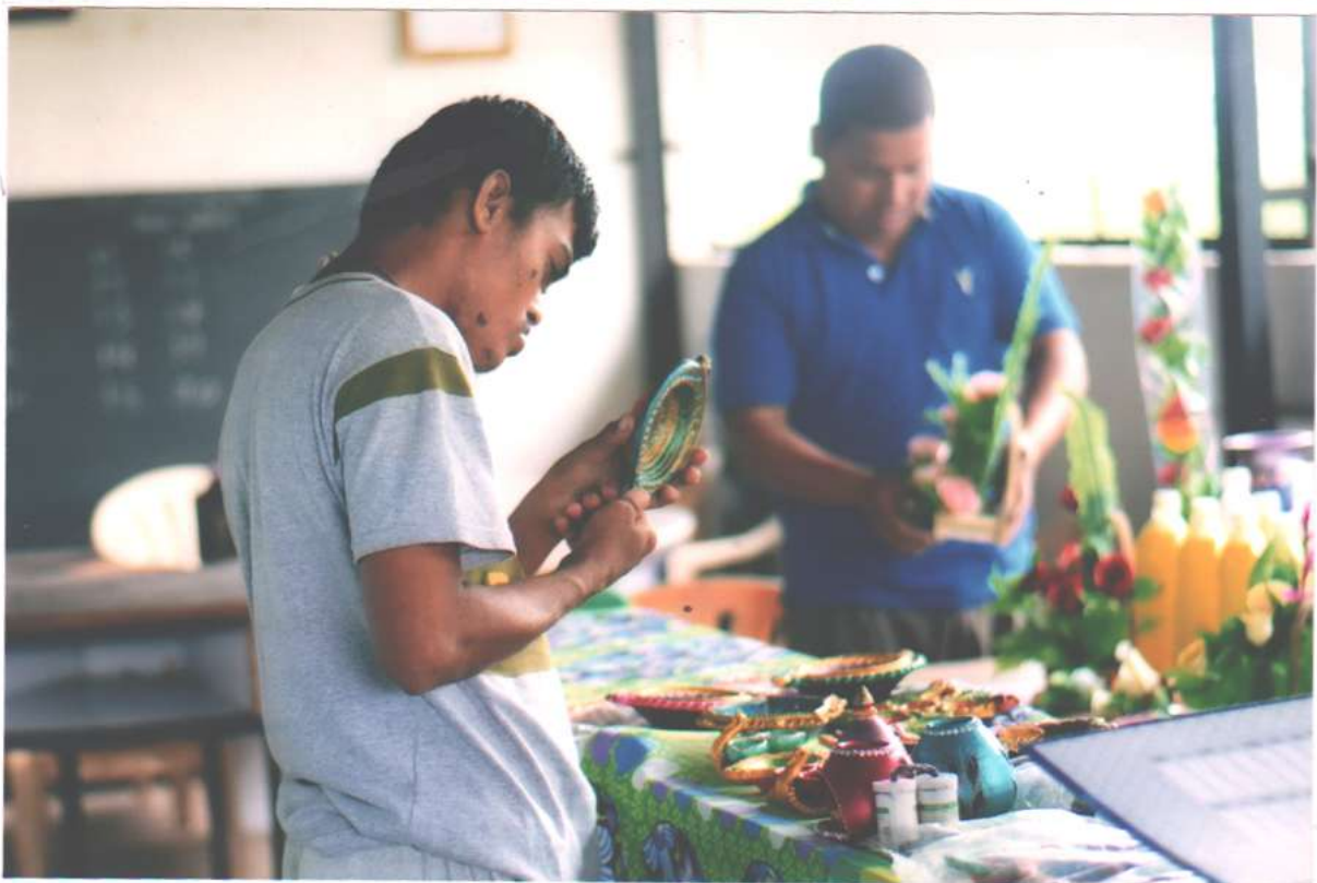
Making Diwali Lamp and Products, 10 Oct 2019