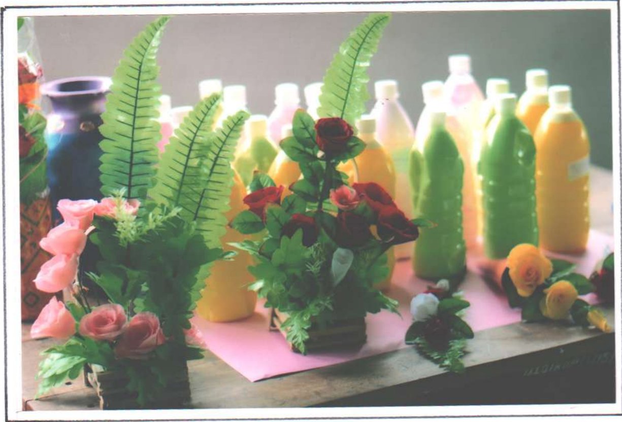
Special products made by students in our school. 19 Sept. 2018.

Late Gampatrao Gadade Residential and Non-Residential School (Project affected colony) Kagal. Tal. Kagal Dist. Kolhapur state. Maharashtra