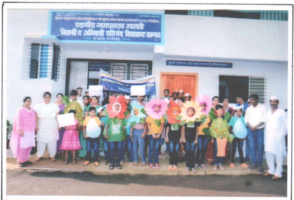
Social and Cultural Activity "Rashadhi Ekadashi". 26 July 2018.