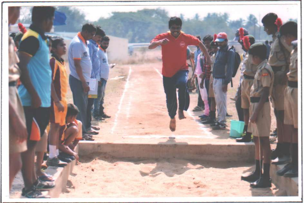
Participate in "World Handicap Day" Sports. - 24 Nov - 2018.

Late Gampatrao Gatade Residential and Non-Residential School (Project affected colony) Kagal Tal-kagal. Dist-Kolhapur. State-Maharashtra.