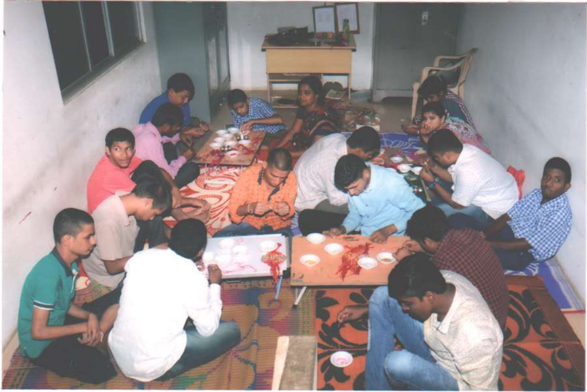
Making Rakhi 8 Aug. 2019.

Late Gampatrao Gadade Residential and Non-Residential school (project affected colony) Kagul. Tal. Kagul. Dist. Kolhapur, state. Maharashtra