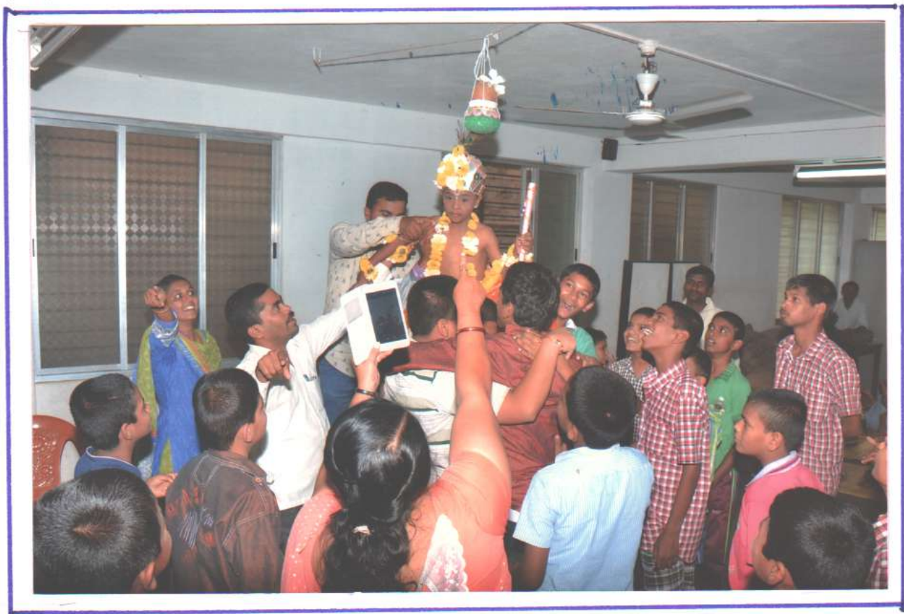
Cultural Event "Dahi Handi" 14 Aug 2018.

Late Gampatrawa Graduate Residential and Non-Residential School (project affected colony) Kagal Tal. Kagal Dist. Kolhapur state- Maharashtra.