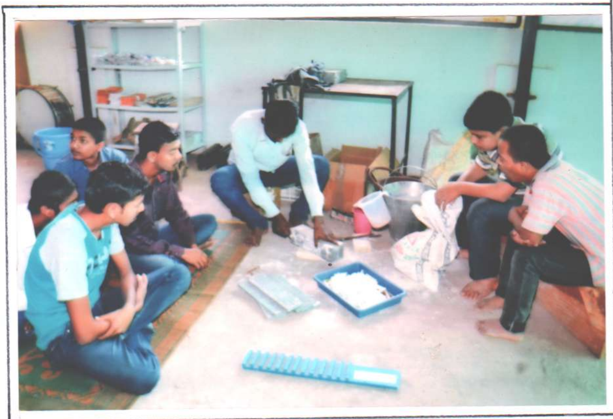
Chalk Making 20 July 2018