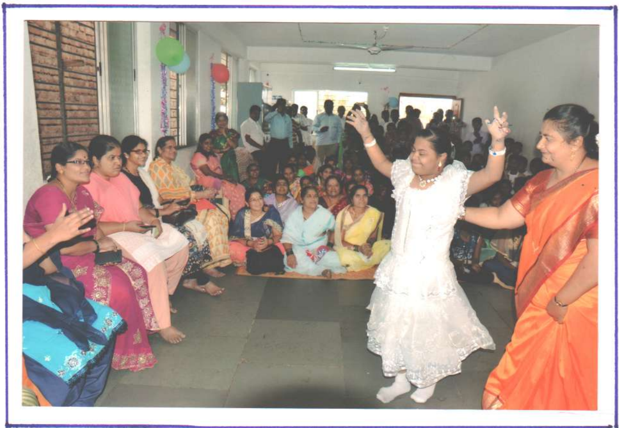
Cultural Program - 40 Jan 2018.