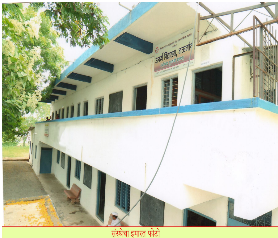
संस्थेचा इमारत फोटो