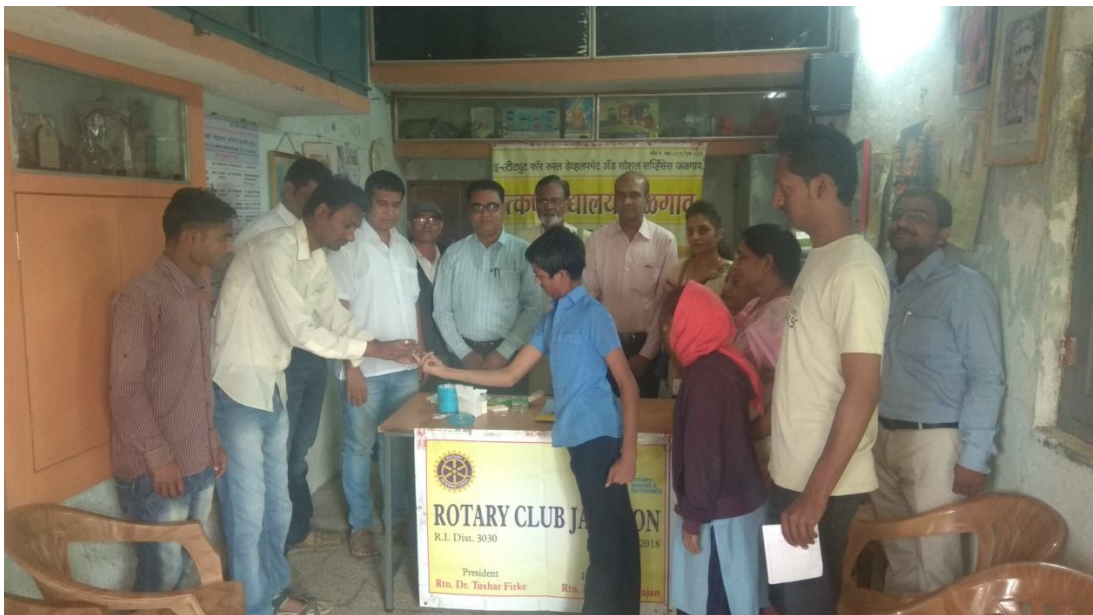
Blood Group investigation programme conducted by Rotary Club Jalgaon in our school.