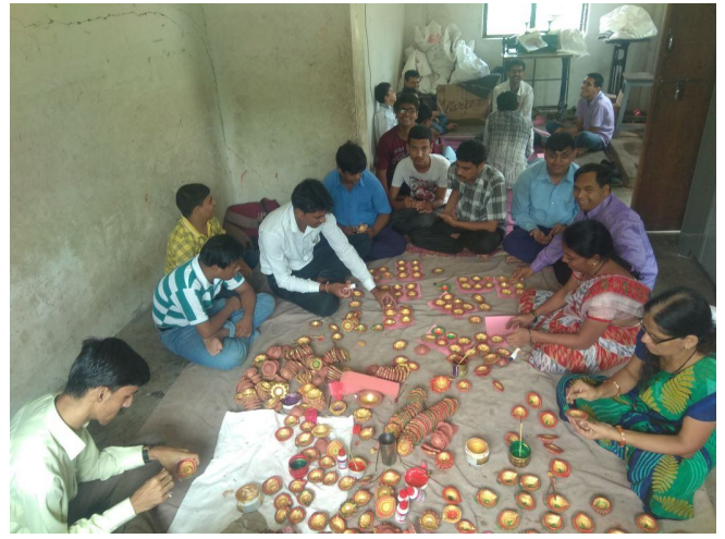
Adult mentors working in the institute are skilled in various workshops of children's workshops.