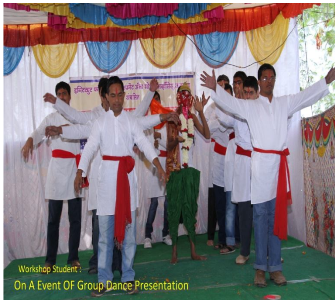
Gathering Programme arranged by our school and mentally disable students participated with Joy.