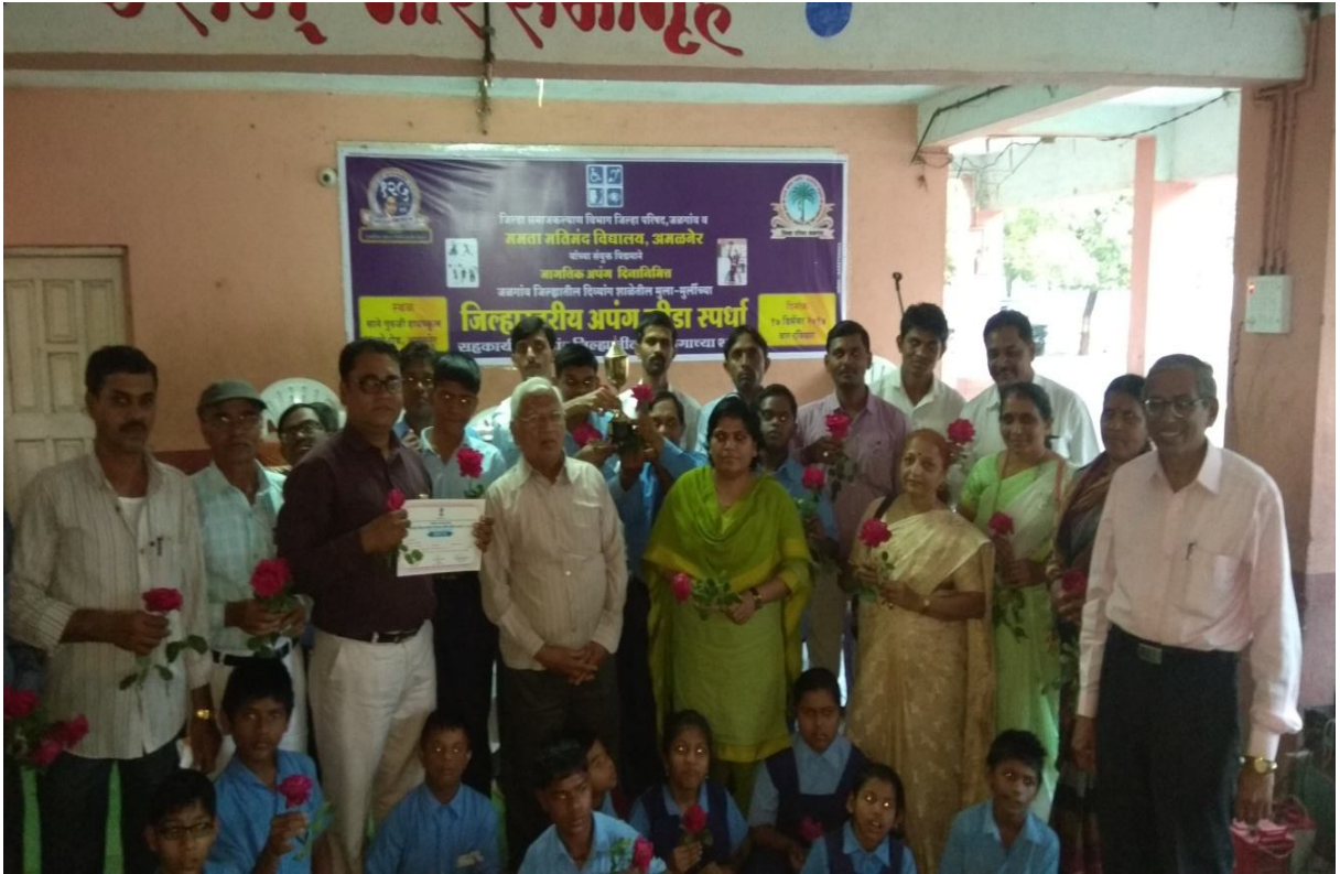
Highest Sports Prize Certificate Distribution Programme which was conducted by District Social Welfare ZP Jalgaon Maharashtra.(2017-18)