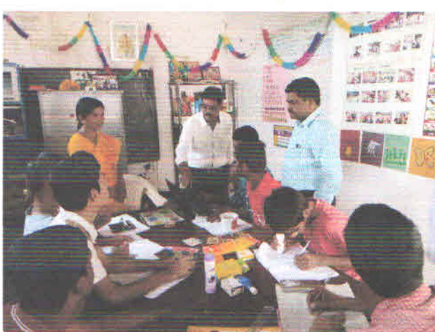
R.D.O, Mahabubnagar visit to our BIMH - School