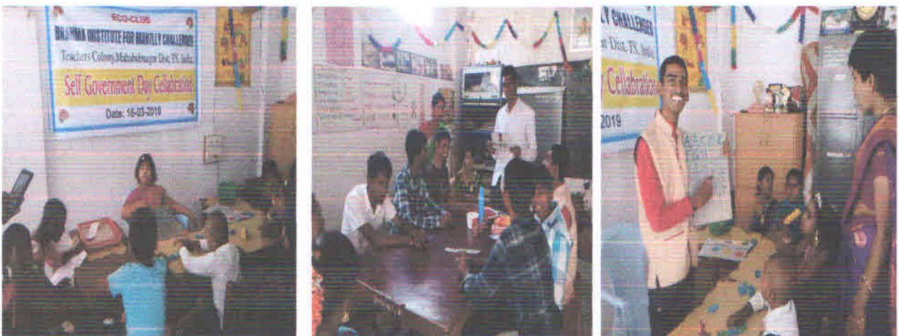
Self Government Day Celebrations

We are regularly celebrates the SELF GOVERNMENT DAY as well this year also we are celebrated the same on 16 th March 2019 with our Special Children. They are acting like their group teacher's role on the day. This is the very good activity the children and parents also feel very happy we are observing the children performing in the class rooms and campus. We are encouraging the children to give the mementos and also facilitation on the same day.