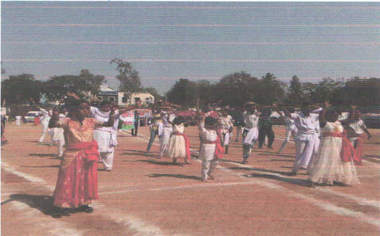
Dance Performance at Parade Grounds, Mahabubnagar by Our Special children