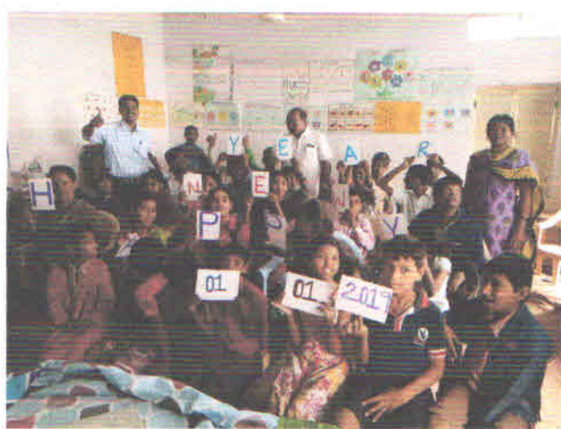
New Year Celebrations