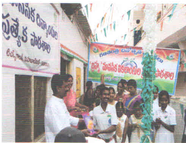
Republic Day Celebrations