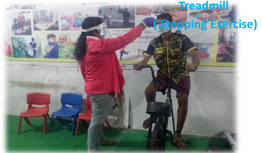
Treadmill (Stepping Exercise)