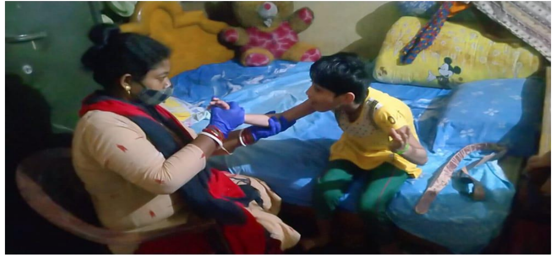
Home Based Therapy with awareness regarding pandemic and distribution of food packet , mask , sanitize items .