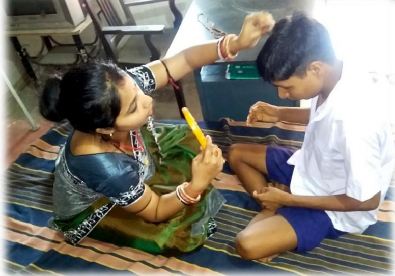
IEP (Skill- Combing Hair)