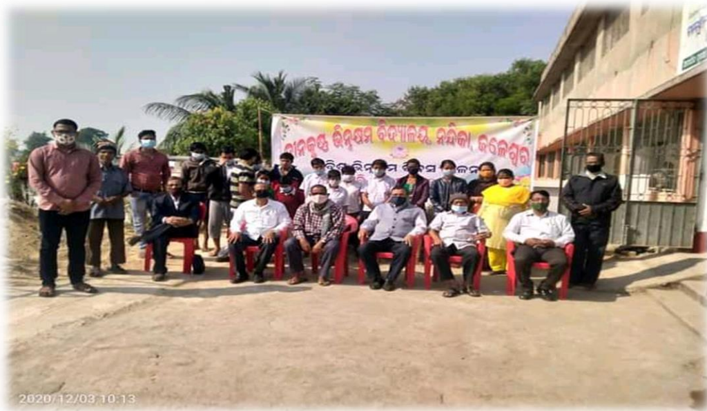
Distribution of Blankets and fruits to students on the occasion of world disable day