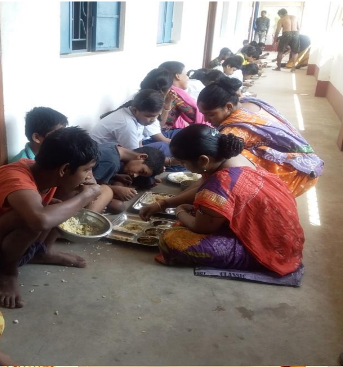
Meal Time Activities