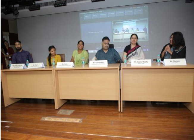
Demonstration of an exhibition of Sambhav: Making Inclusion possible (Assistive Devices for Persons with Cerebral Palsy)