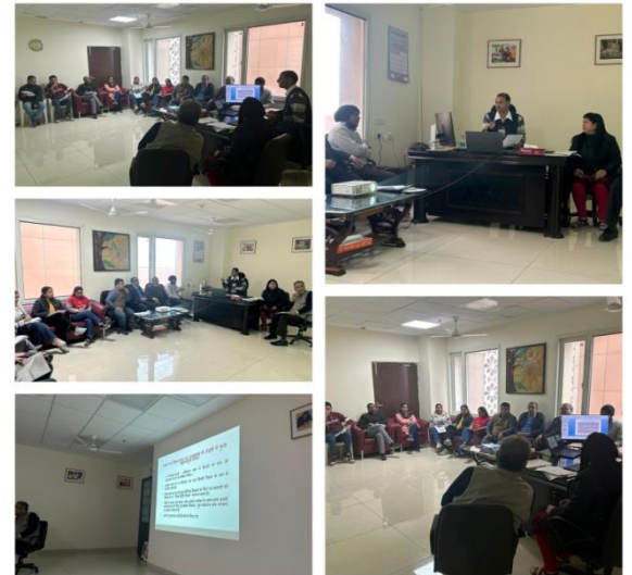
National Trust Staff participated in Workshop on usage of Hindi Language