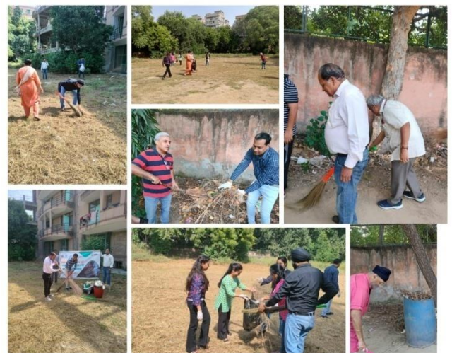
Swachhhta Abhiyan Campaign organized at HCPA, a Registered Organization of National Trust on 2 nd October 2023

(iv) Celebration of 9 years of Swachh Bharat Mission – The National Trust celebrated Swachh Bharat Mission from 15 th September, 2023 to 2 nd October, 2023. The theme of the event was "Garbage Free India". On ground activities on the theme, National Trust officials took oath on Swacchta. Swachh Bharat Abhiyan drive was also conducted by National Trust at Handicapped Children Parents Association (HCPA), Sec-5, Dwarka, a Registered Organization of National Trust. All Staff of the National Trust participated in cleanliness drive.