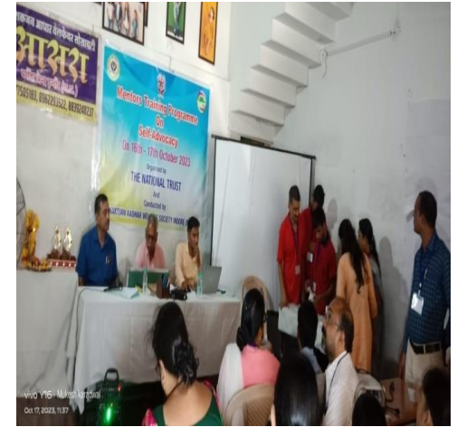
Glimpses of Mentors Training Programmes conducted at various places of the country.