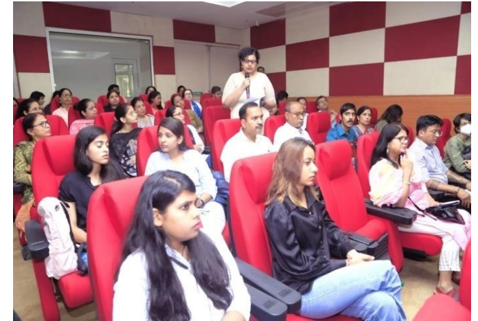
Autism Conclave on 30 th May 2023 organized under Chairmanship of Secretary, DEPwD & Chairperson, National Trust