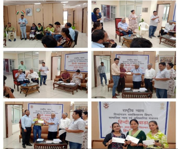
All Staff of the National Trust participated in Hindi Pakhwada

The National Trust observed Hindi Pakhwada from 14 th September 2023 to 29 th September 2023. On 29 th September 2023, National Trust organized 'Hindi Pratiyogita' in which all staff of National Trust participated. Prizes were distributed among the winners.