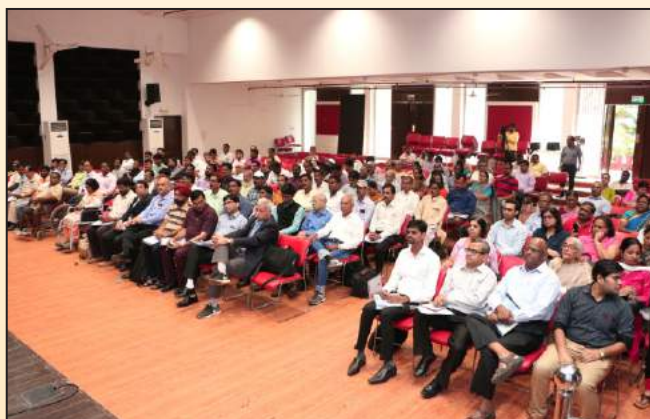
18th Annual General Meeting, Vishwa Yuvak Kendra, Chanakyapuri, New Delhi-10th September 2018

This was followed by detailed discussion (open House) on various schemes of the National Trust. The ROs and other participants sought discussions, answers, clarifications and made suggestions on various issues / schemes to the National Trust.