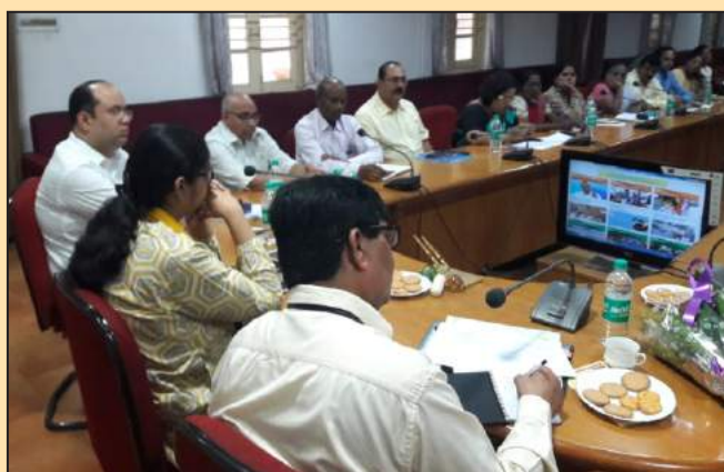
Workshop with District Authorities on LLC and Schemes & Programmes of the National Trust, Jabalpur, MP-9/8/2018