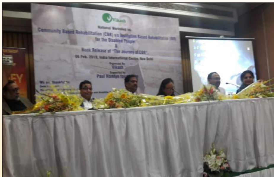
Workshop on Community based Rehabilitation - 6/2/2019

During the presentation various issues of Persons with Disabilities and their redressal through modern age Digital Technology were highlighted. This workshop was organized by Vikas, a registered organization of the National Trust based in Bhubneswar.