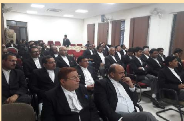
Sensitization Programme for Practicing Lawyers of Jabalpur High Court on National Trust Act, 1999-9/8/2018