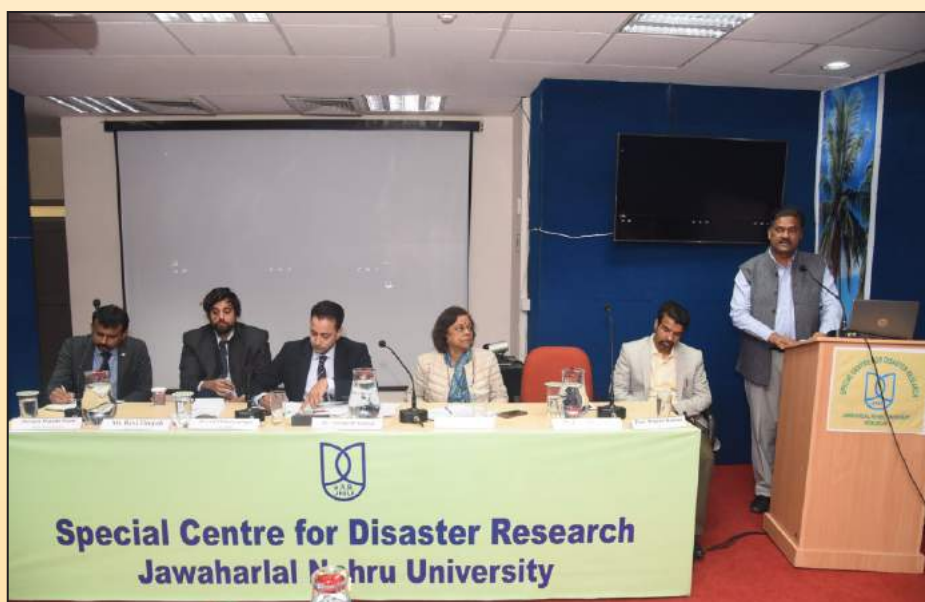
Presentation on Disaster Preparedness in Odisha and the measures for Senior Citizens, Divyangjans by JS&CEO at JNU – 13/03/2019

A Global Symposium on Artificial Intelligence and Disaster Management was organized by the Special Centre for Disaster Research, Jawaharlal Nehru University in New Delhi on 12 th -13 th March 2019. The experience of JS&CEO, National Trust in mainstreaming disability with disaster management considered a landmark in the annals of disaster management in the country.