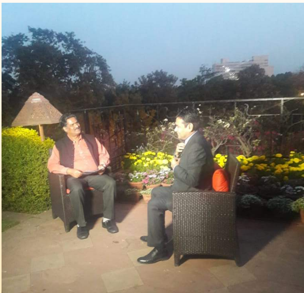
Press Interview of Joint Secretary and Chief Executive Officer, National Trust on the occasion of World Down Syndrome Day - 15.3.2019