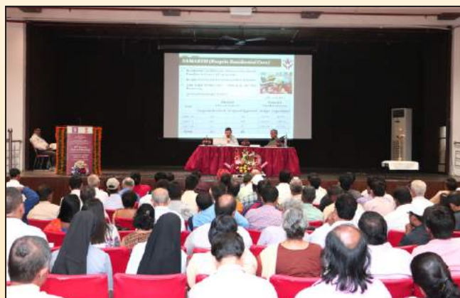
Question-Answer Session-18th AGM 10/9/2018