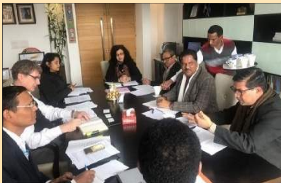
Consultation Meeting between WHO and National Trust for collaborating in Assessment and Certification of Autism and Universal Early Intervention Programme-22/1/2019