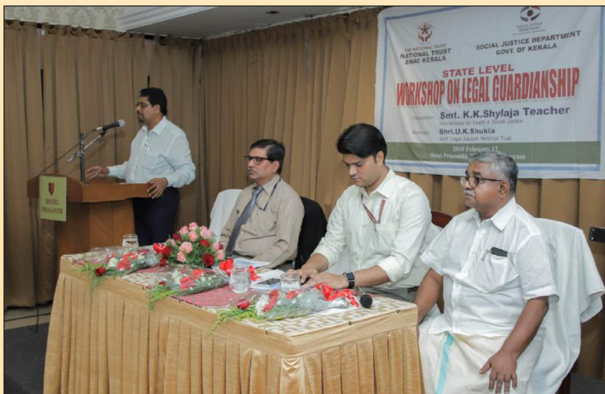
State Level Workshop at Kerala organized by State Govt. on LLC and Legal Guardianship-12/2/2019

The participants in the workshop were representatives of District Collector, District Police Chief, Secretaries of District Legal Services Authority who are Sub.Judges, District Law Officers, District Medical Officers, District Registrars, District Social Justice Officers, District Child Protection Officers, LLC NGO Members and LLC PwD Members. Total participants attended the workshop was 126.