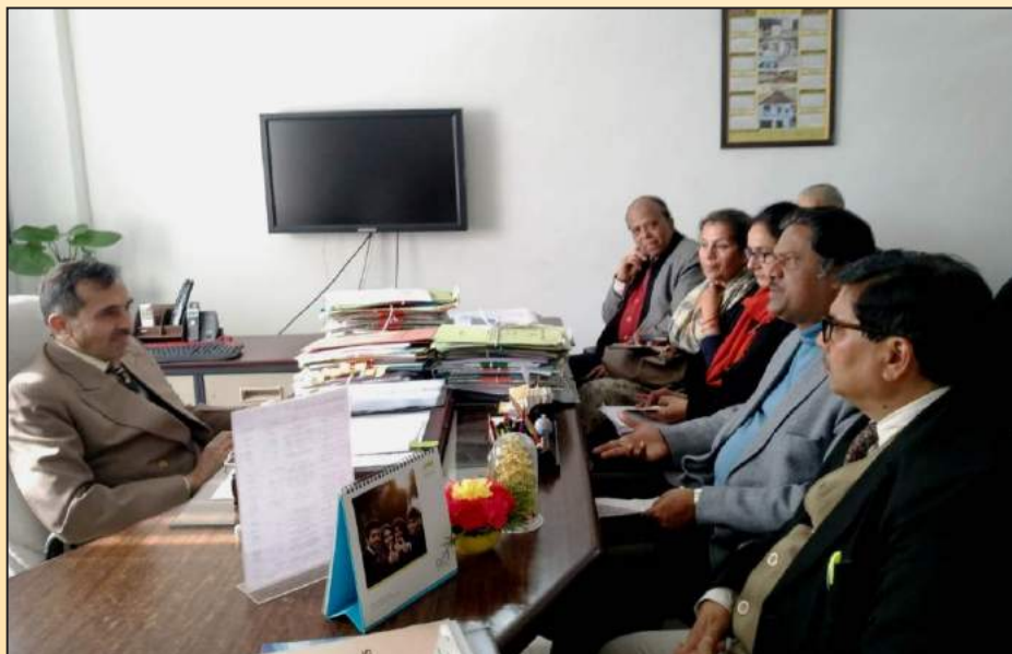
SLCC Meeting at Uttarakhand-4/2/2019

The JS&CEO, National Trust participated in the SLCC meeting along with Assistant Legal Advisor in Dehradun on 4 th February 2019. The meeting was attended by the Additional Chief Secretary (ACS) and Principal Secretary, Social Welfare Department, Uttarakhand, State Disability Commissioner, Additional Secretary, State Social Welfare Department.