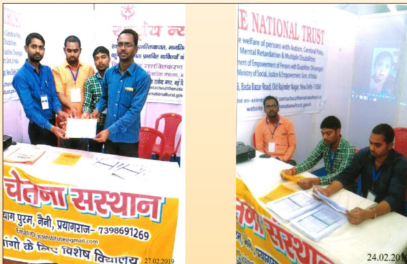
Participation in Gramodaya Mela, Chitrakoot-24-27 February 2019

The National Trust participated in 'Gramodaya Mela' at Chitrakoot during February 24-27, 2019 as part of celebrating the birth centenaries of great social reformers Shri Nanaji Deshmukh and Shri Deendayal Upadhyaya. During the Mela, booklets and brochures of the National Trust displayed. The visitors informed about the schemes and activities of the National Trust through power point presentation. Videos and movies also showed depicting the achievements and good practices of the Persons with Intellectual and Developmental Disabilities and the organization/professionals working in the field. Various issues of Divyangjan including issuance of disability certificate, getting various facilities and privileges to these persons through the Central and State Government schemes were also addressed.