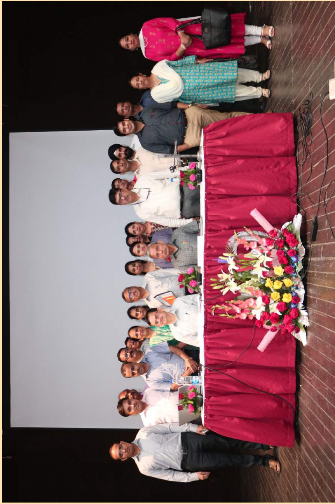
Group photograph of National Trust staff of 18 th Annual General Meeting of National Trust held at Vishwa Yuvak Kendra Delhi on 10.09.2018