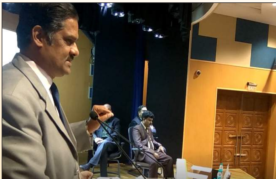
Presentation by JS&CEO on Digital Inclusion of Divyangjan at Ambedkar International Center, Delhi – 01/02/2019

The JS&CEO, National Trust made a detailed presentation in “National Consultative Seminar on mainstreaming the marginalized through Digital Inclusion” organized by PHD Chamber of Commerce & Industry, Delhi on 1st February 2019 in Ambedkar International Center, Delhi.