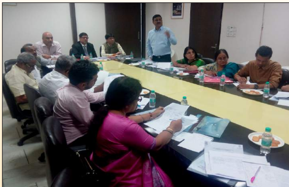
Review Meeting of SNACS held in Delhi on 12/11/2018