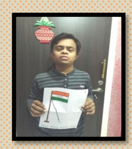
Louis Braille Day celebration