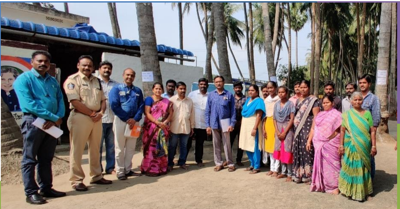
DISTRICT LEVEL JJ ACT COMMITTEEN MEMBERS ALONG WITH OUR STAFF

Secretary thanked all the committee members for making aware about Covid-19 and motivating all of us. We promised to follow all the instructions what they guided and mentioned. Vice-President and Secretary follow-up the visit and on behalf of this visit explained to all the staff towards present situation of the increasing cases of Covid-19 throughout the world and especially in India we have a huge number of density of population, if there is no such restrictions it'll be a great loss in all the way in our country. So not only as single, as a group and as team we must follow, must guide, must aware and must motivate how much we can, what we can and taking this as our personal responsibility. They thanked all the staff for their dedication towards caring the children.